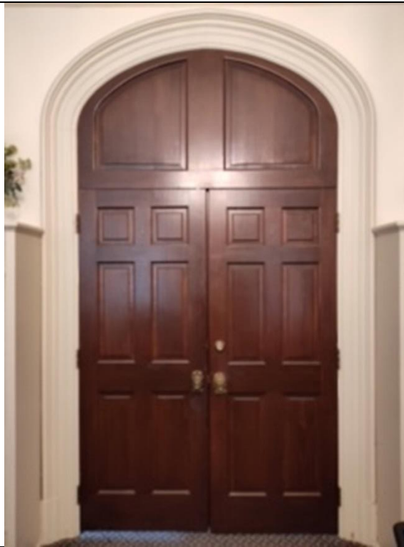
Typical interior door