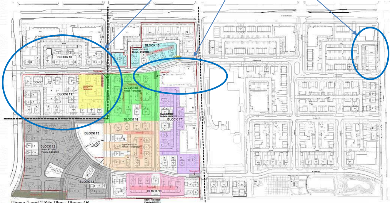
Phase 1 and 2 Site Plan - Phase 4B