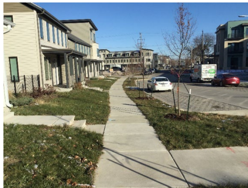
Trees of 65 th Street (upper left)