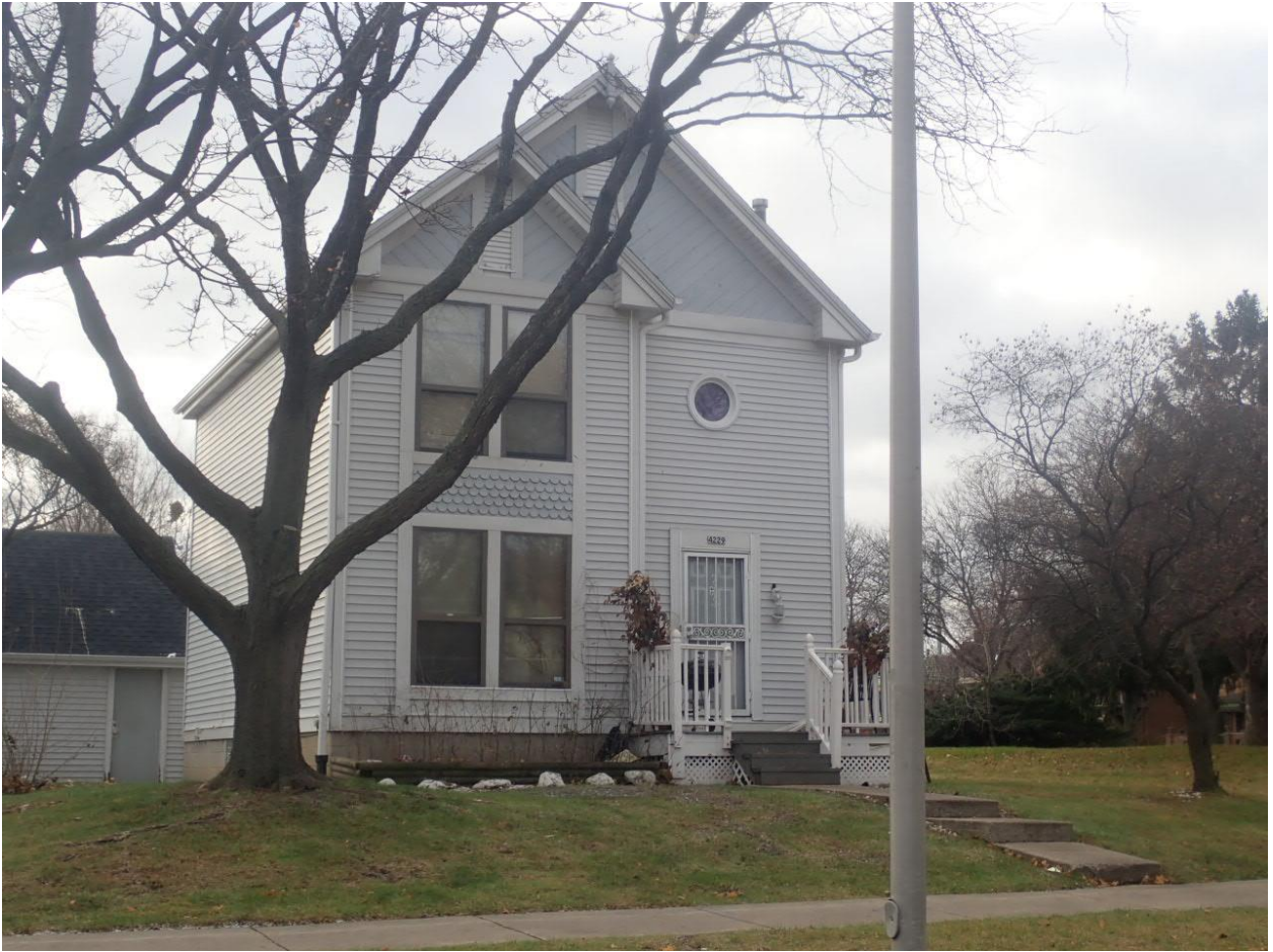
4229 W Meinecke