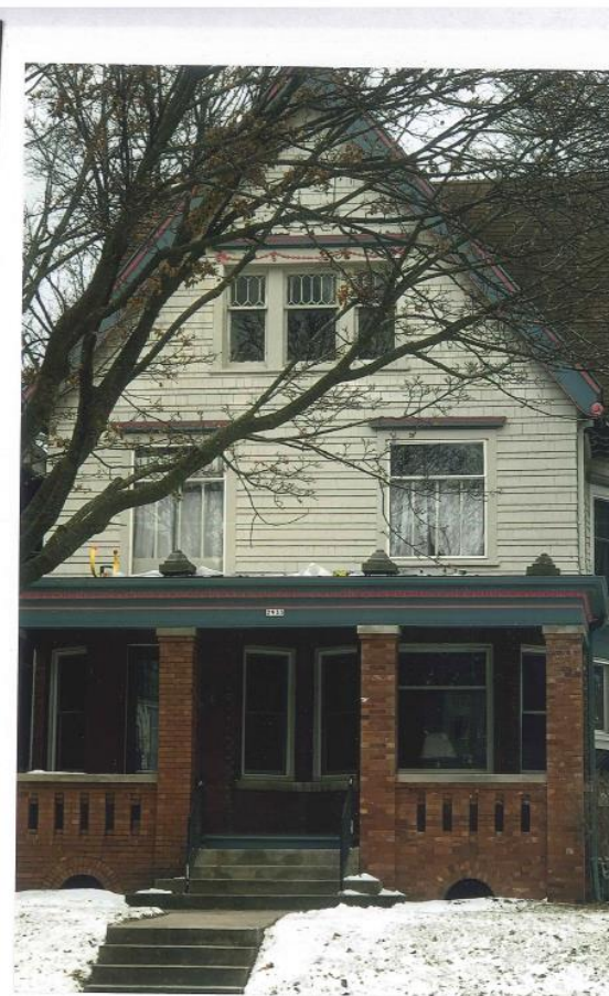
Current conditions at property.