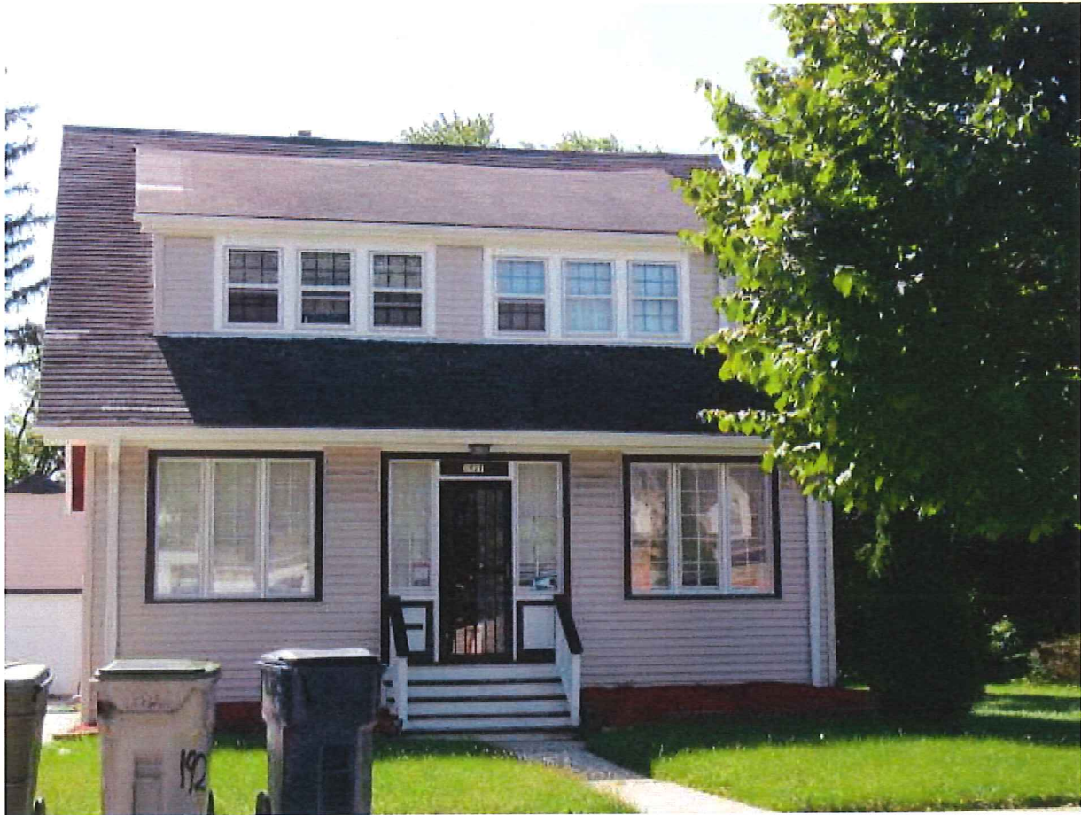
1921 W Fairmount Ave