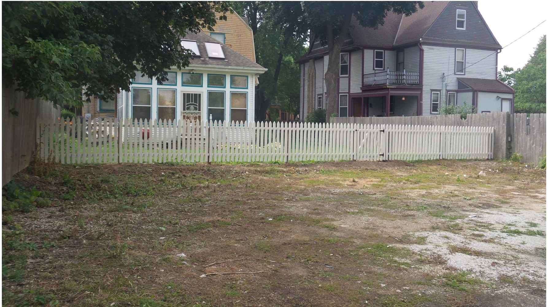
Photo of fence as installed.