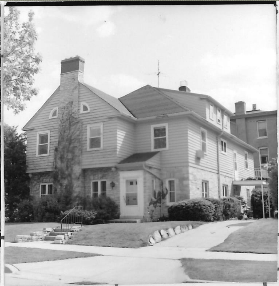
HPC Survey Photos 1978