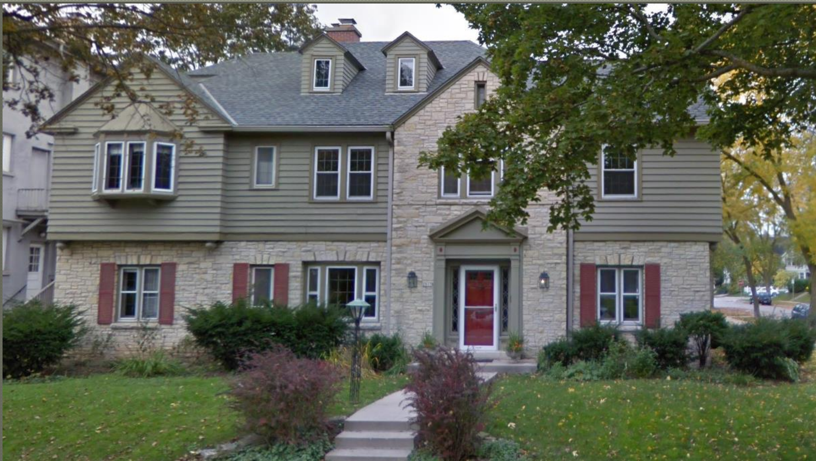
Appearance ca. 2016