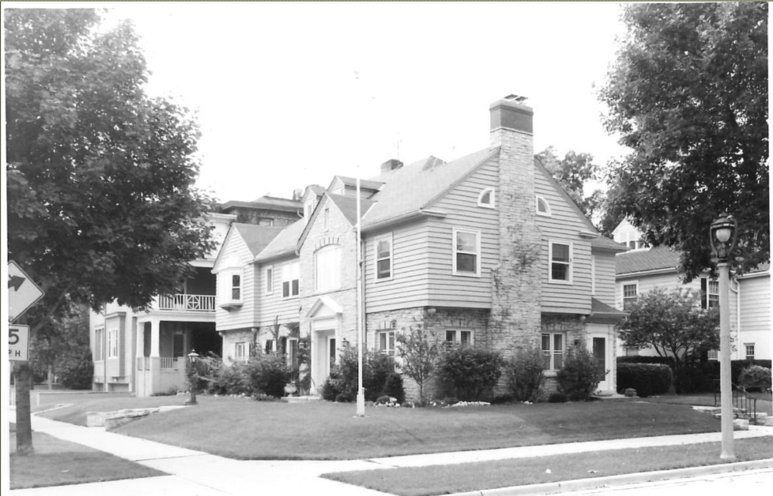
Intensive Survey Photo 1987