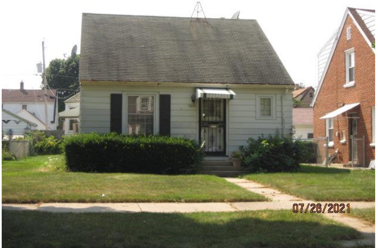
5045 North 24 th Pl