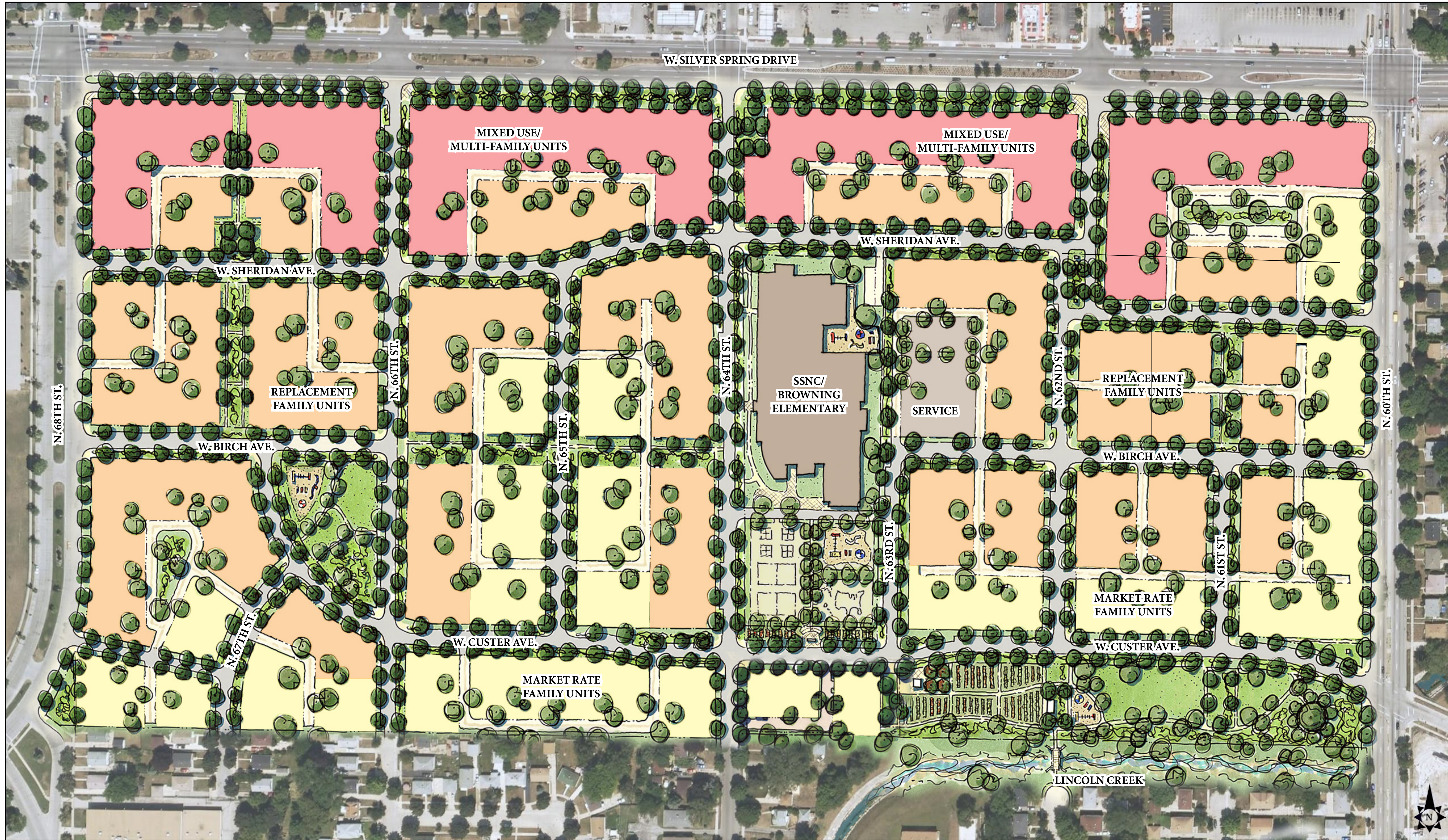
ILLUSTRATIVE OVERALL MASTER PLAN