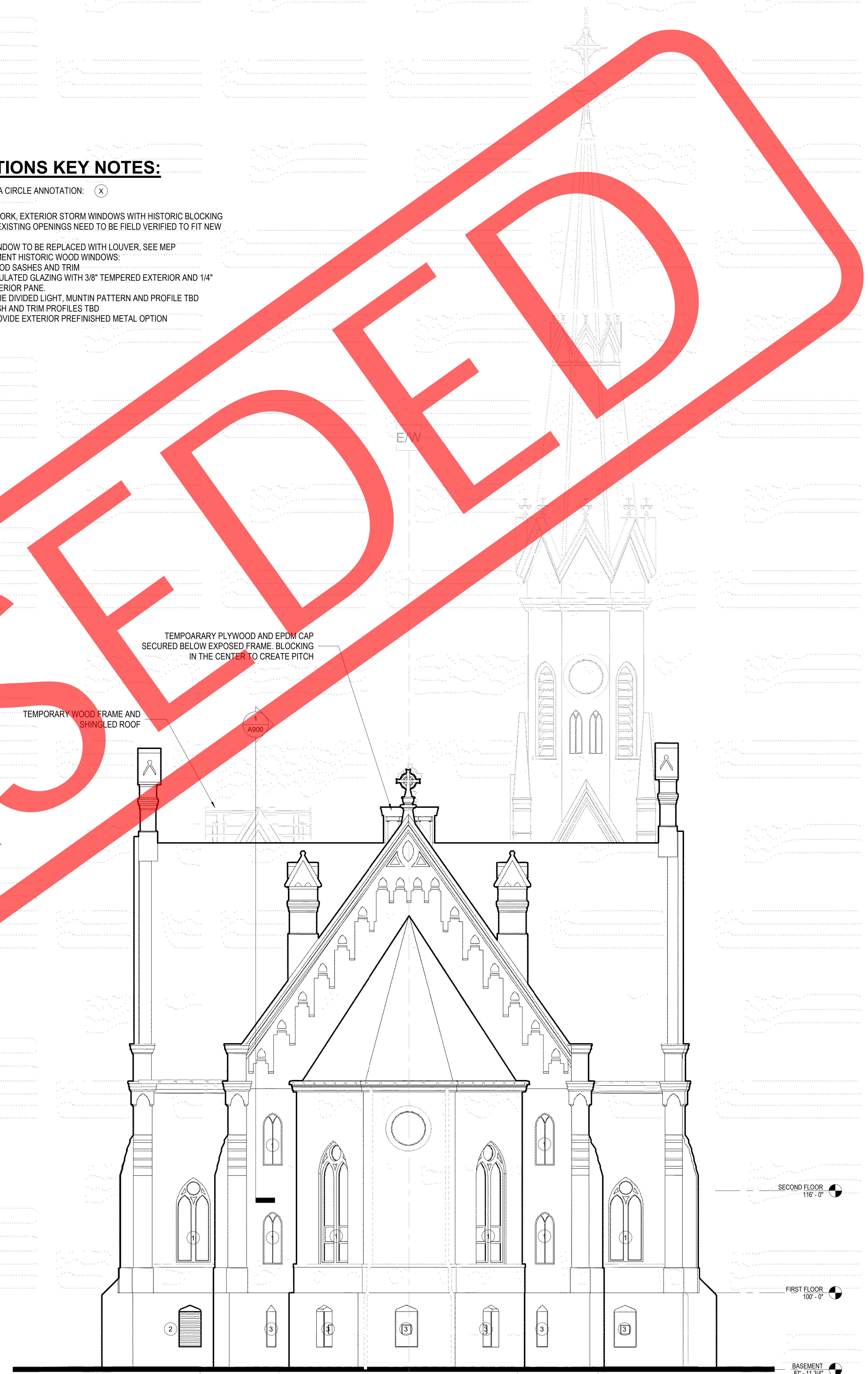
2 BUILDING ELEVATION - EAST SCALE: 1/8" = 1'-0"