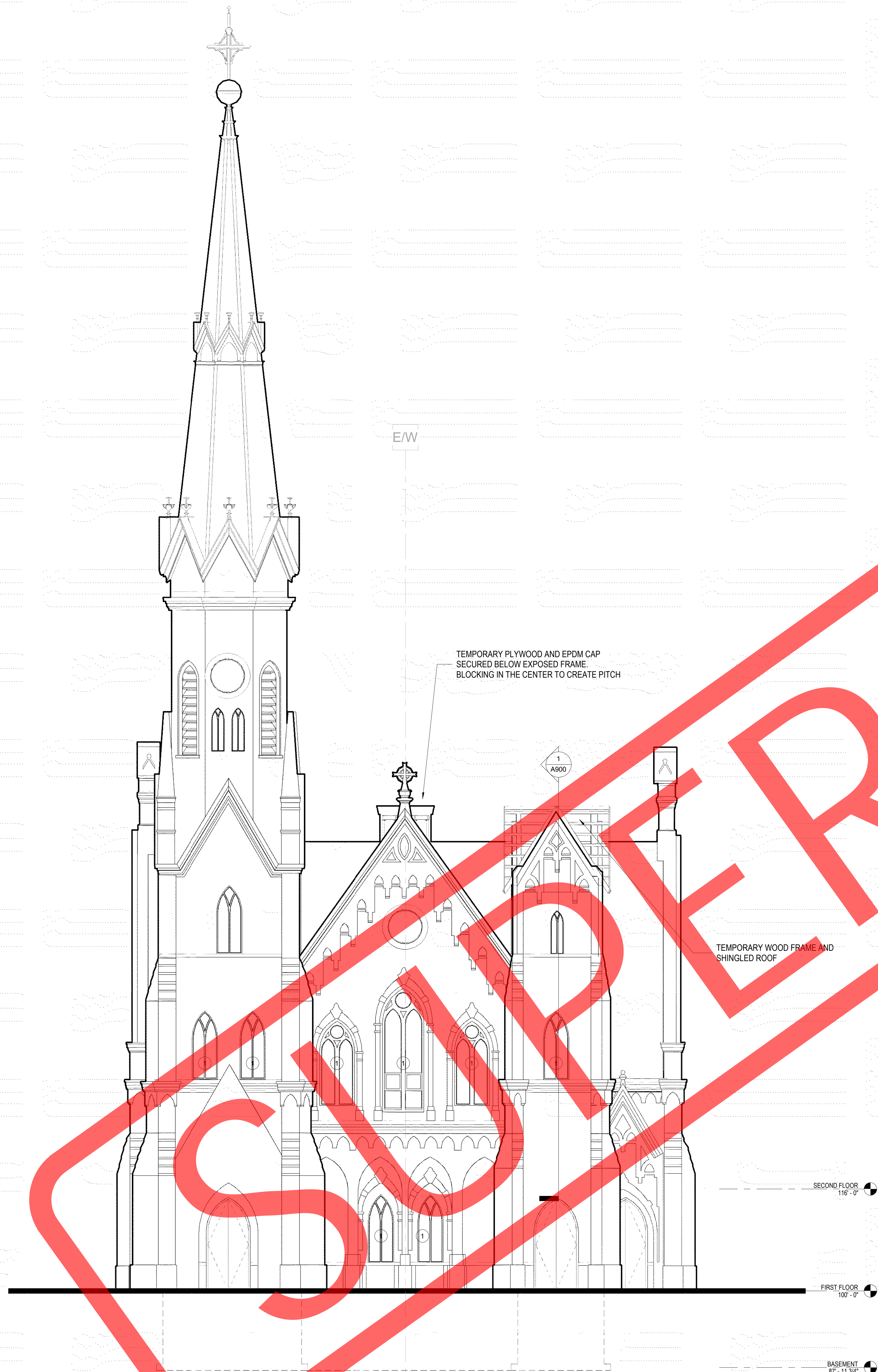
1 BUILDING ELEVATION - WEST SCALE: 1/8" = 1'-0"