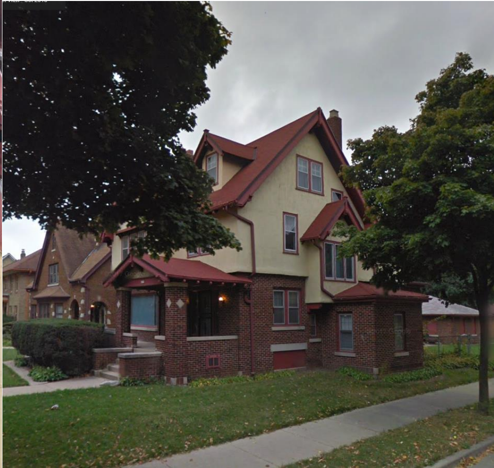
Typical soffit damage and overview of property