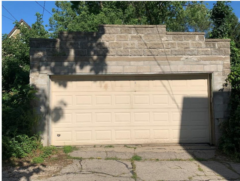
Existing garage west elevation.