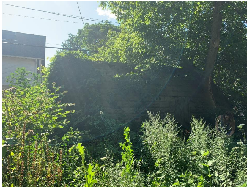
Existing garage east elevation.