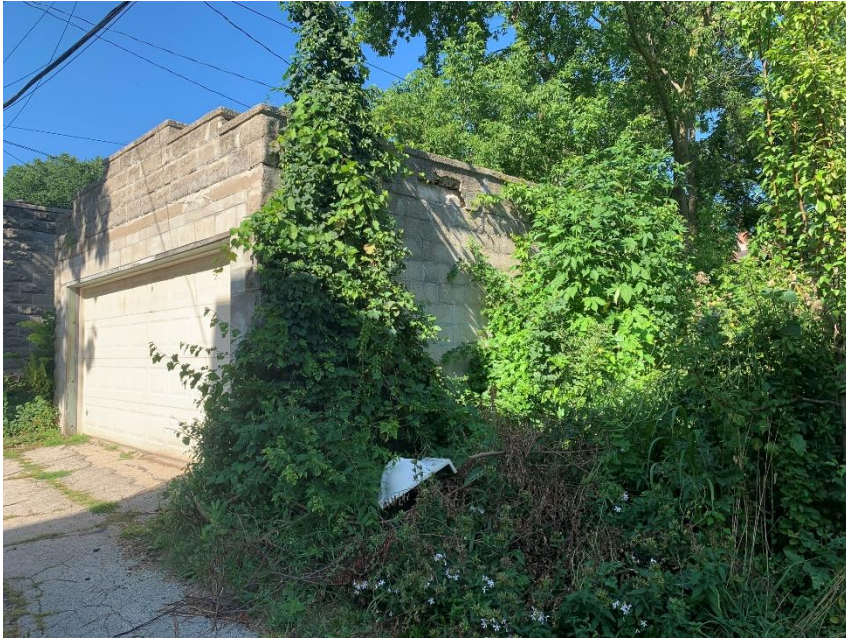
Existing garage southwest elevation.