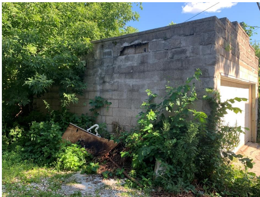
Existing garage northwest elevation.