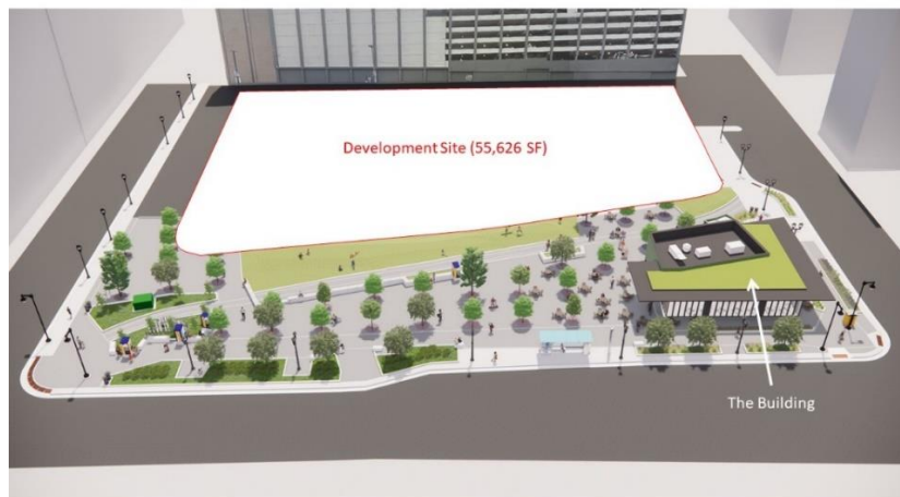
Rendering of the Vel R. Phillips Plaza, looking south

The Building at VRPP, which is located on a portion of the RACM-owned property at 401 West Wisconsin Avenue.