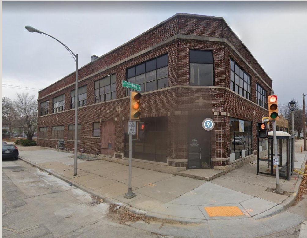
Former CYD Building