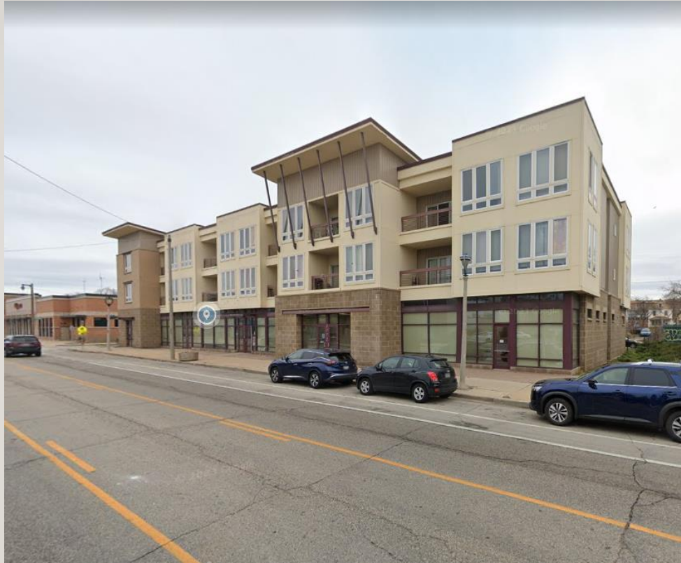
King Drive Commons