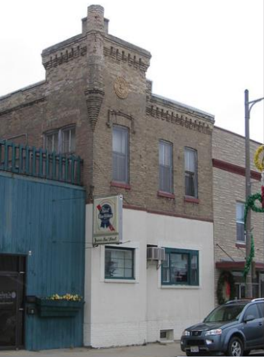
Brillion, Wisconsin at left