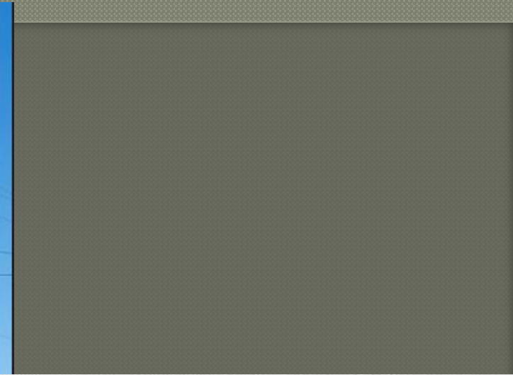
1300 16 th Street Racine, Wisconsin (1901)