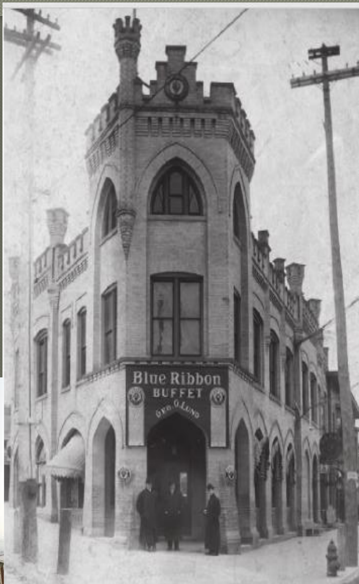
Milwaukee County Historical Society photograph above