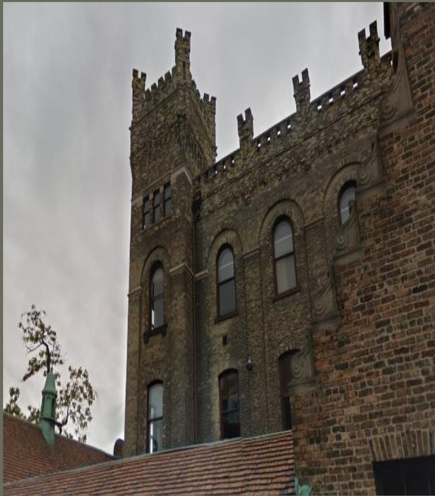
At the Pabst Complex