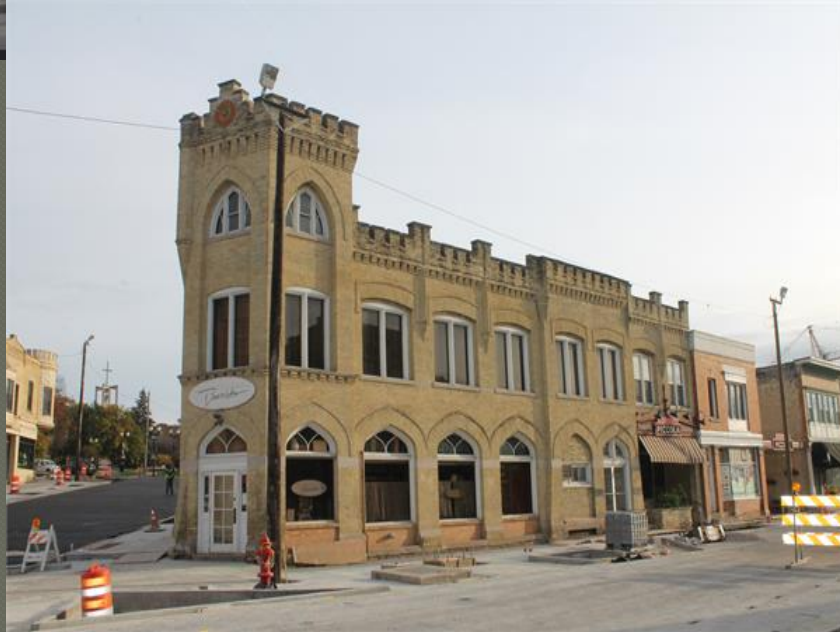
7616 West State Street Wauwatosa, below and right (1899, 1902)