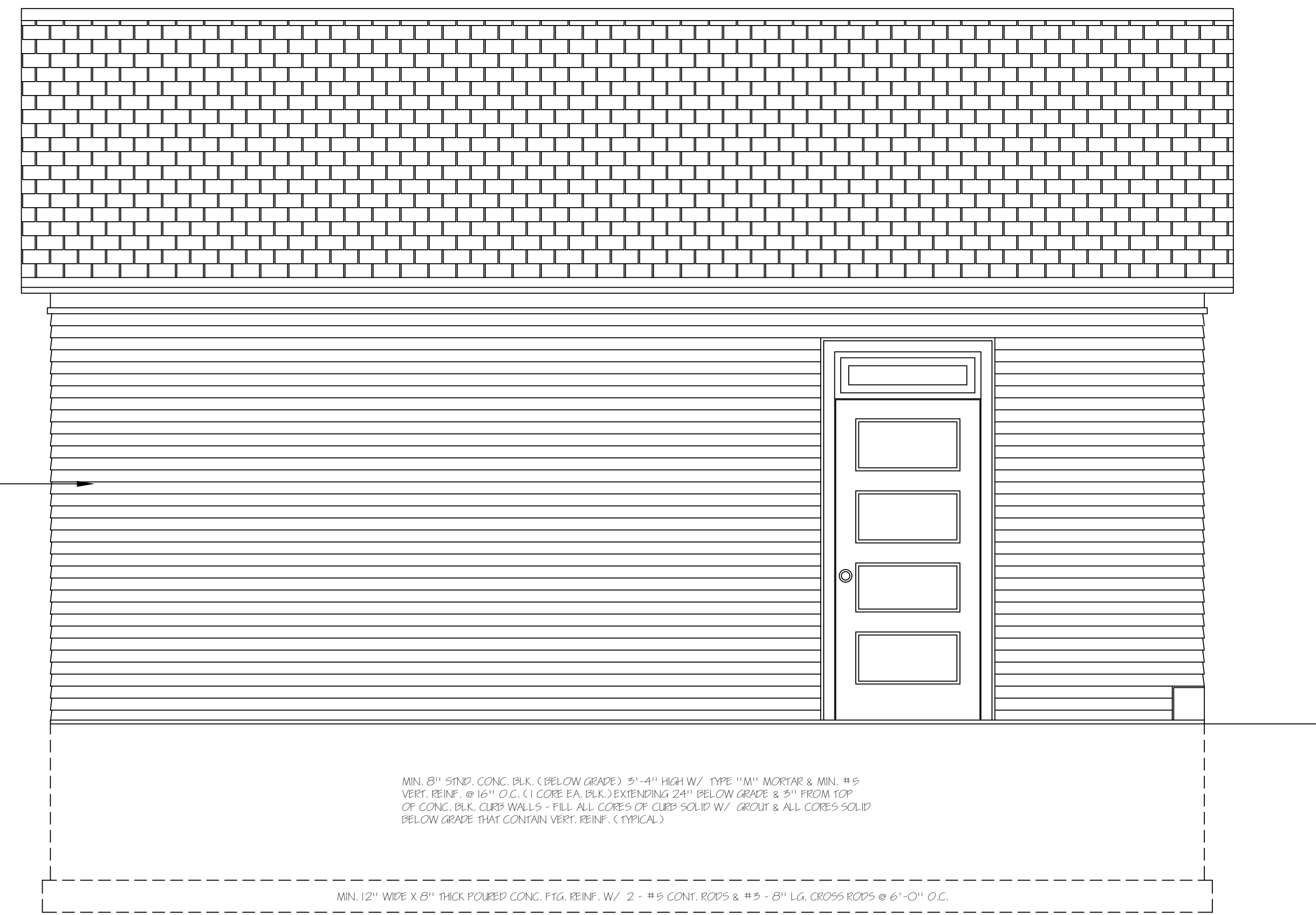
PRELIMINARY SOUTH ELEVATION - SCALE - 1/2" = 1'-0"