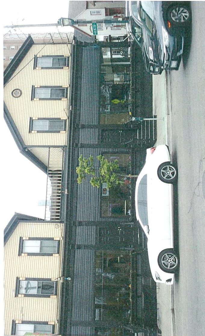
Present conditions of primary façade