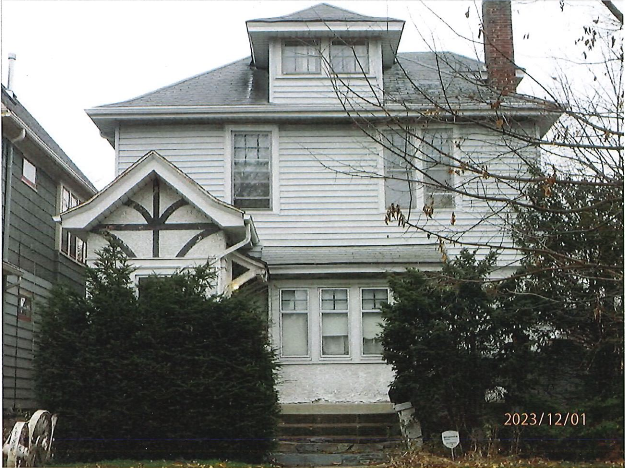
1800 North 48 th Street