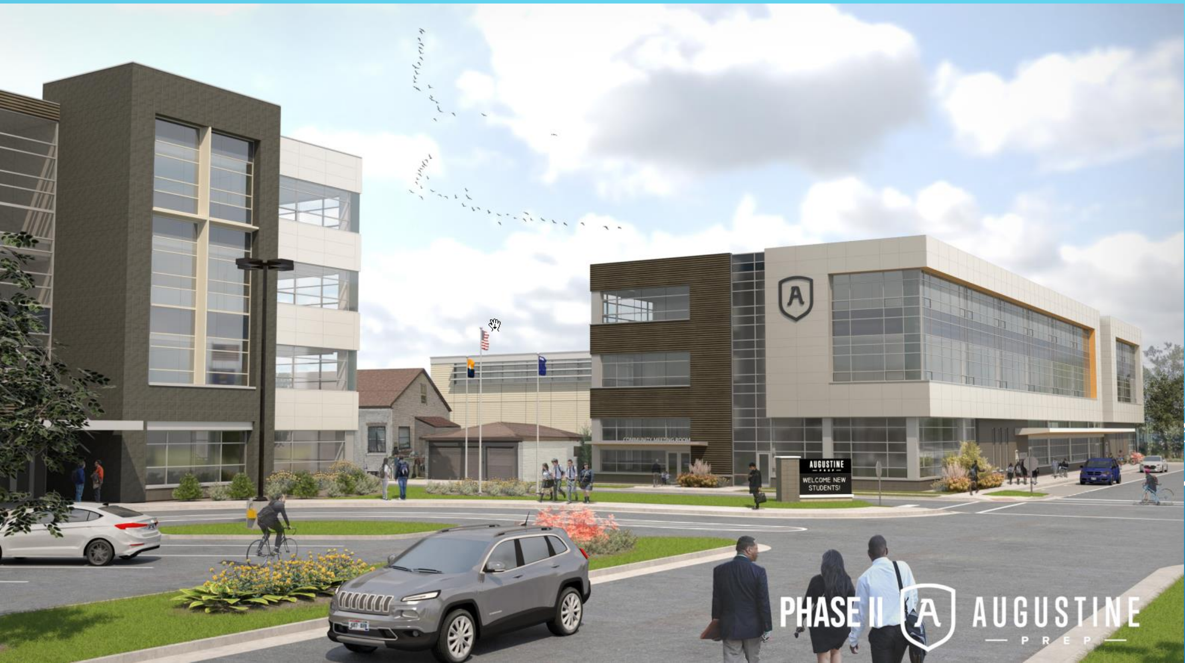
View to North up South 5 th Street from Existing Facility