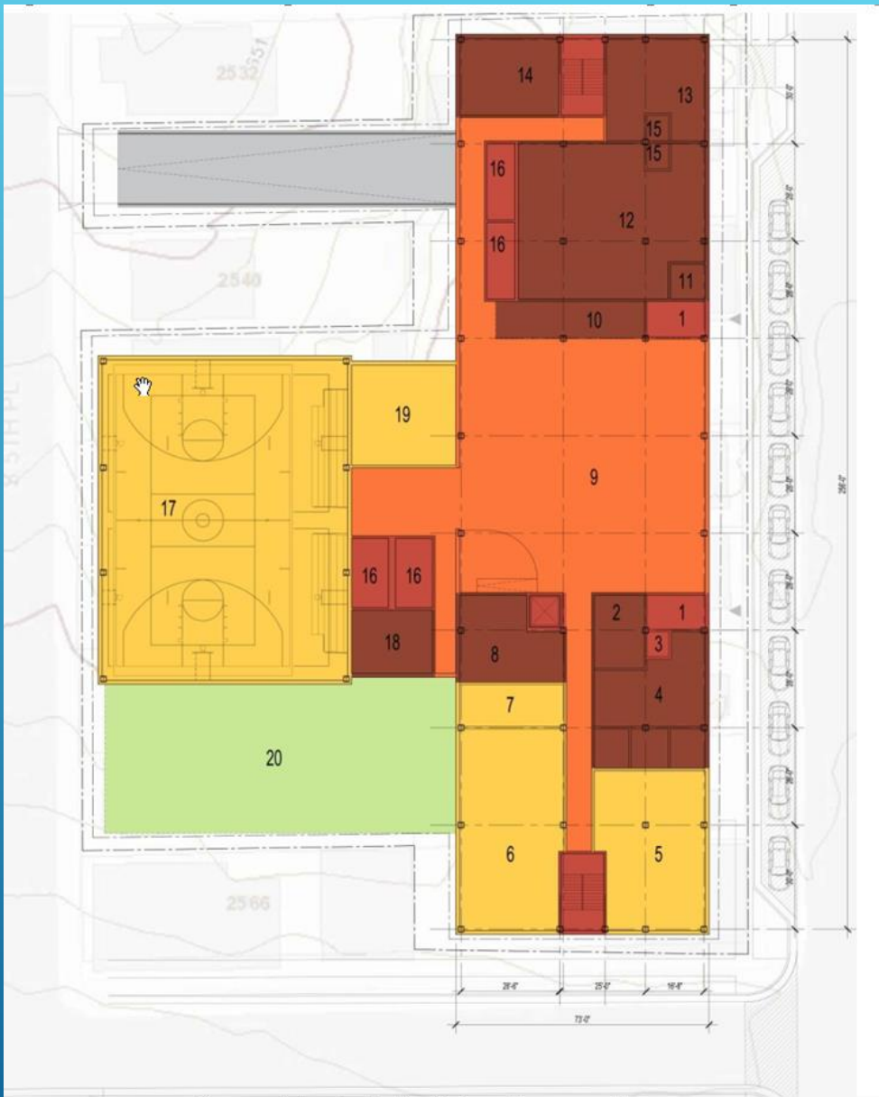
Proposed site plan for The St. Augustine expansion.