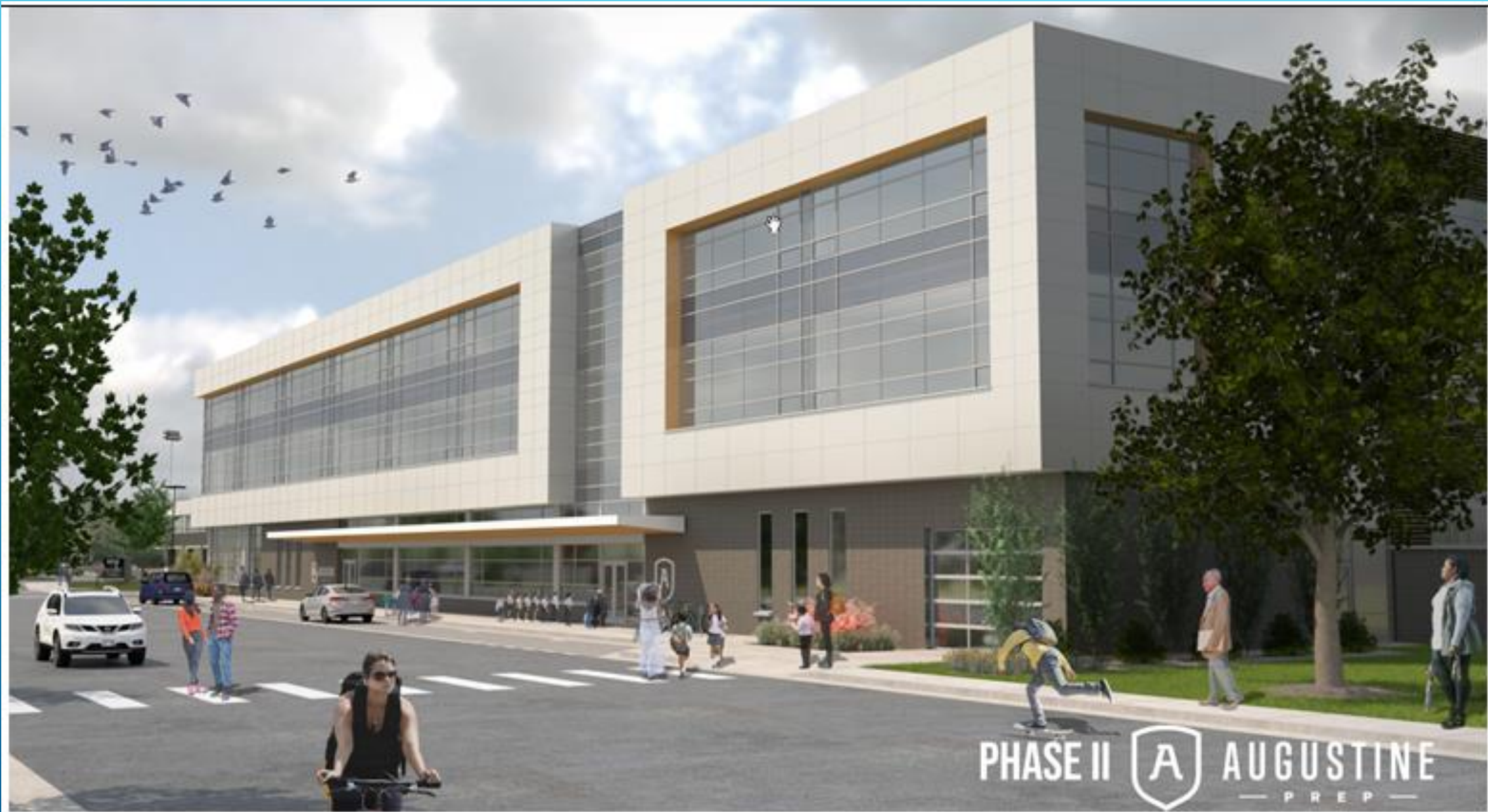
View to Main Façade on South 5th Street