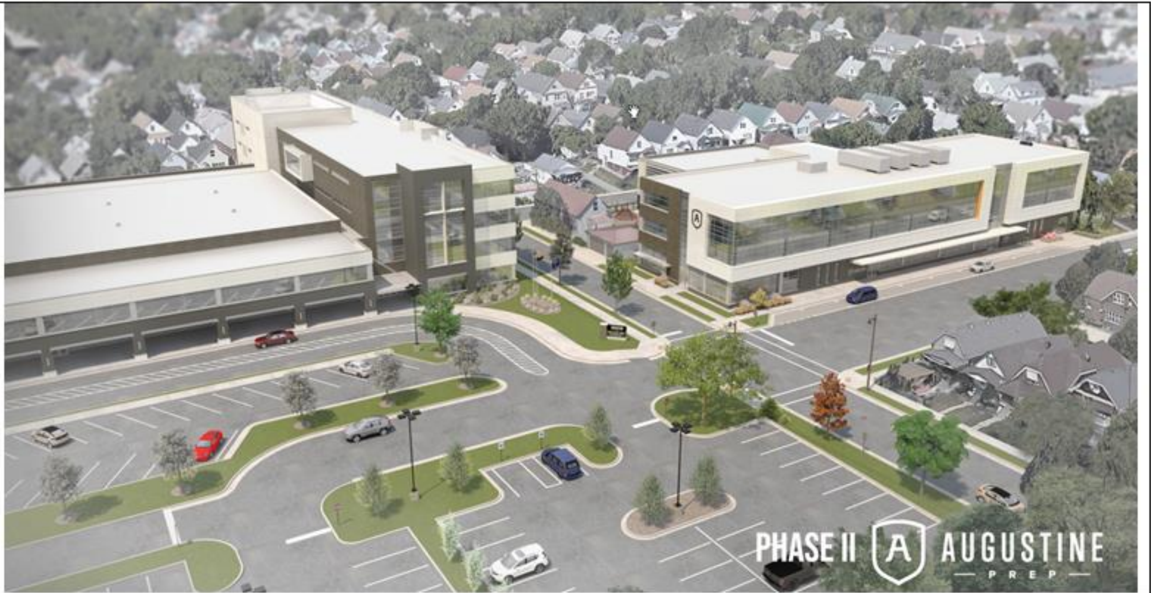
Aerial View to the Northwest.