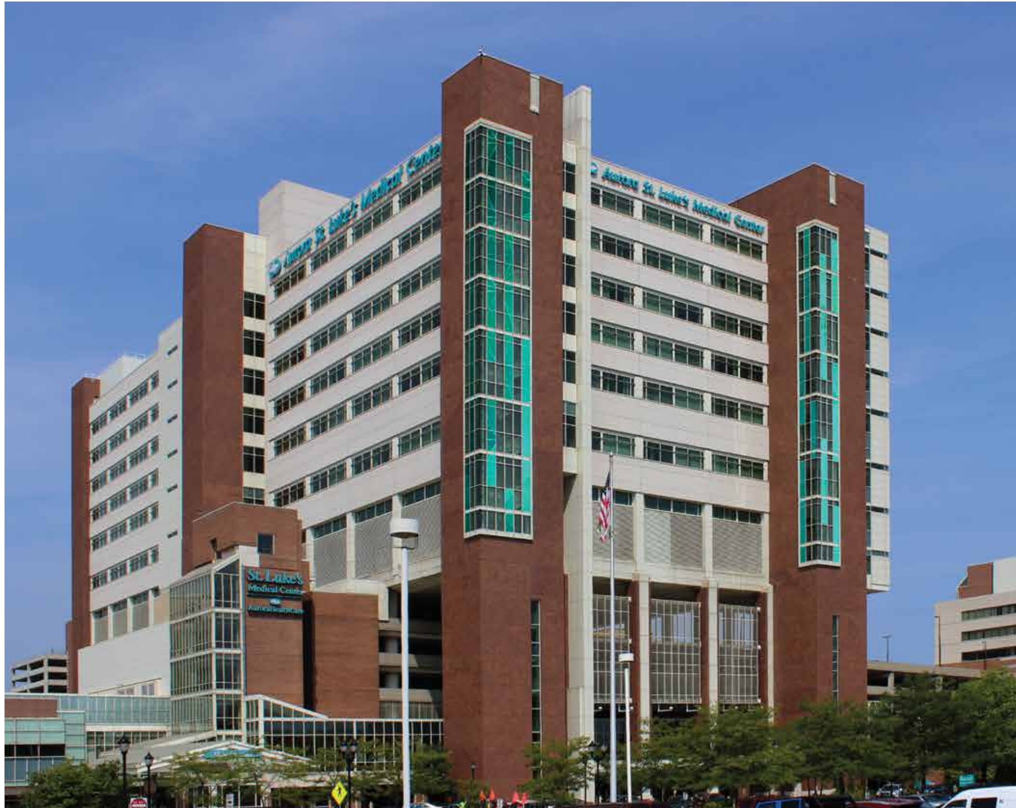
A.1 Elevation Rendering