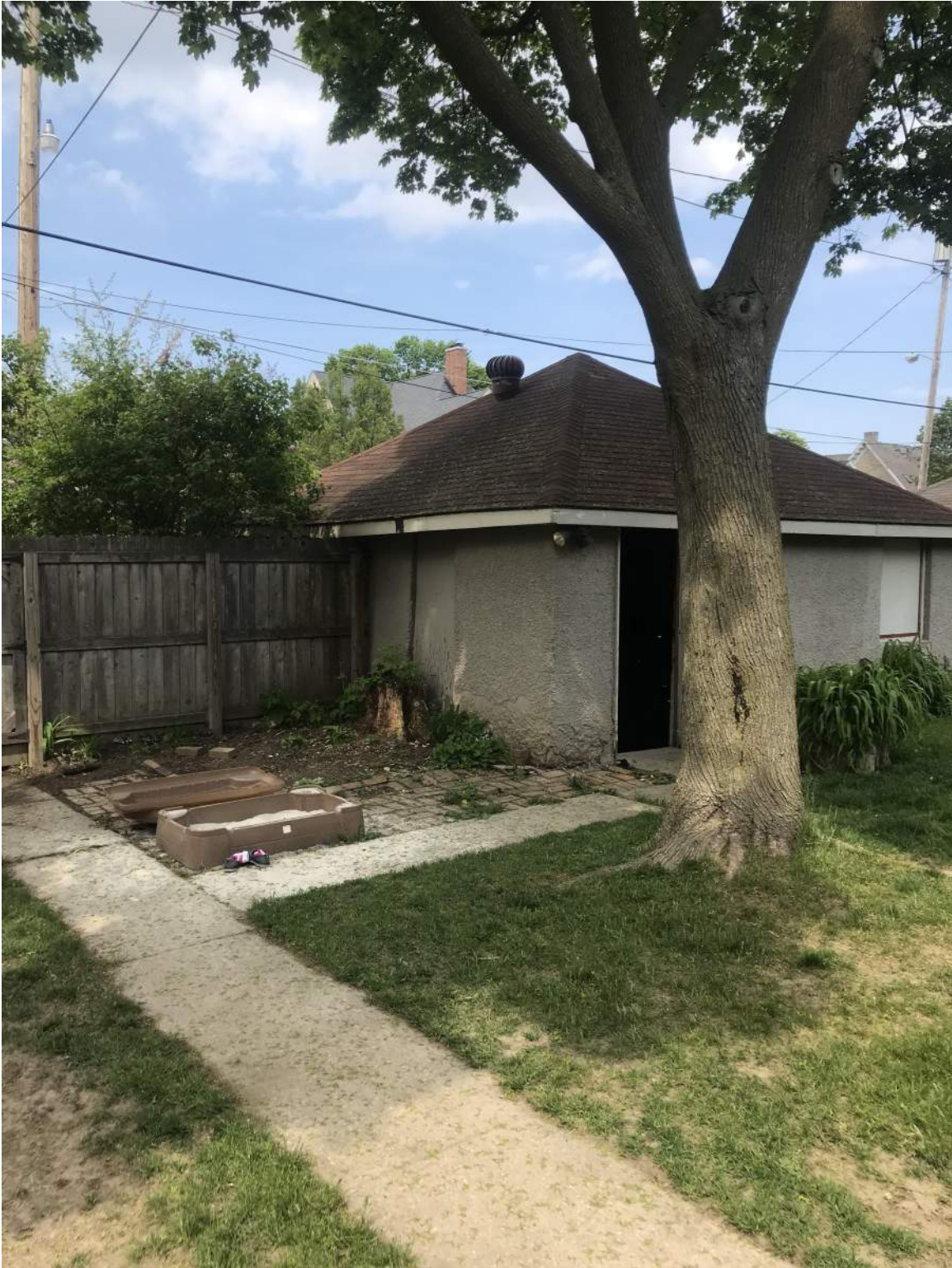
Photo 2 - Southwest Corner of the Existing Garage