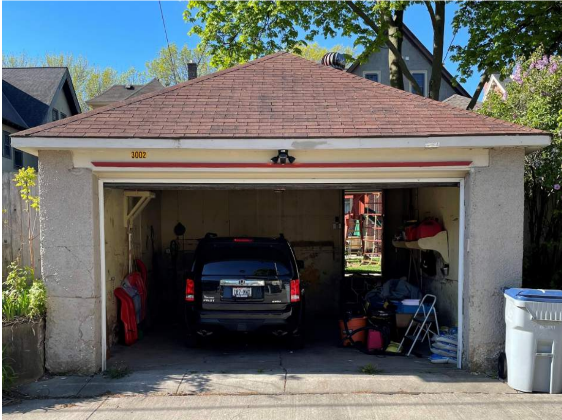
Photo 5 - North Elevation of the Existing Garage