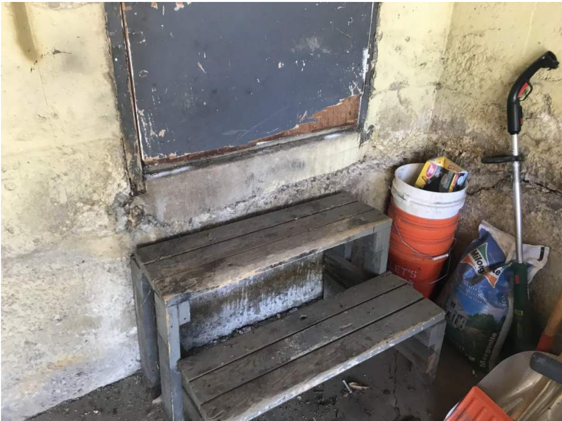
Photo 11 - Southwest Corner of the Interior of the Existing Garage Showing Deterioration of the Structure by the Service Door