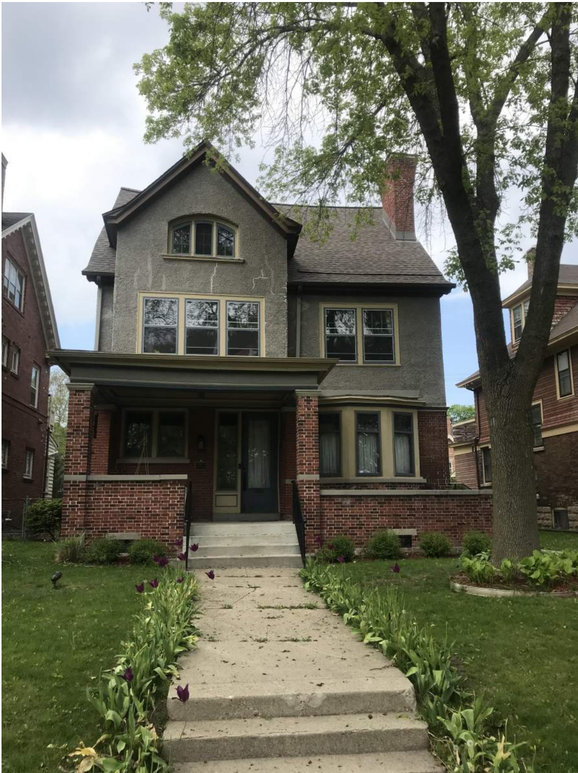
Photo 1 - View of South Elevation of the House