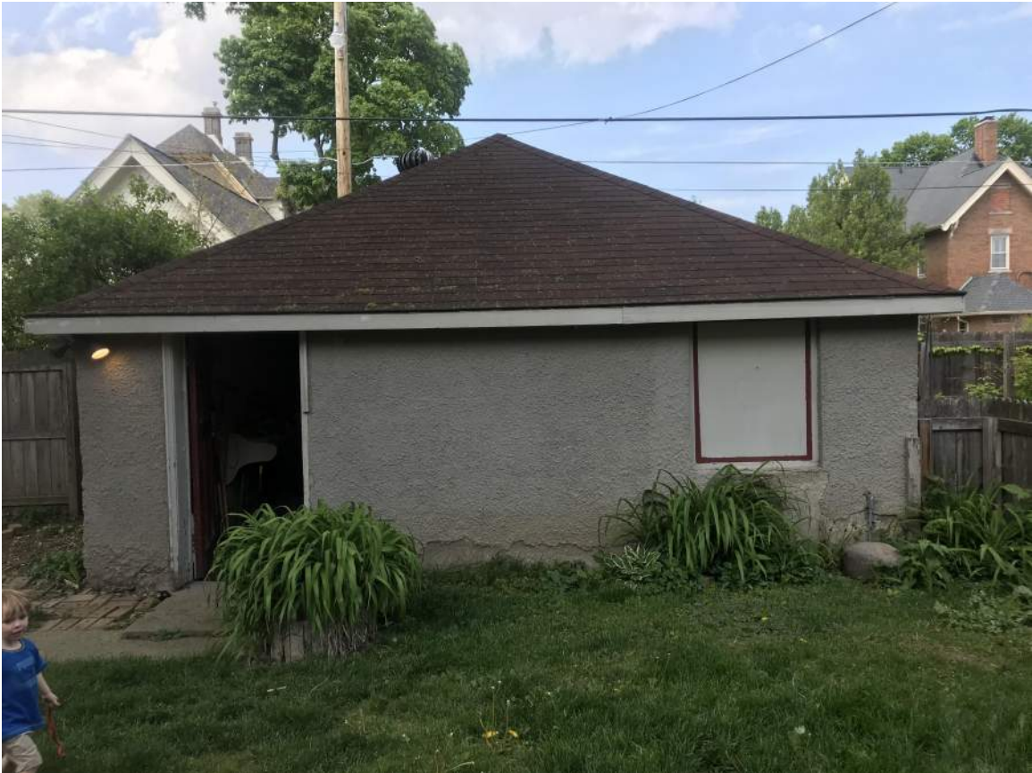
Photo 4 - South Elevation of the Existing Garage