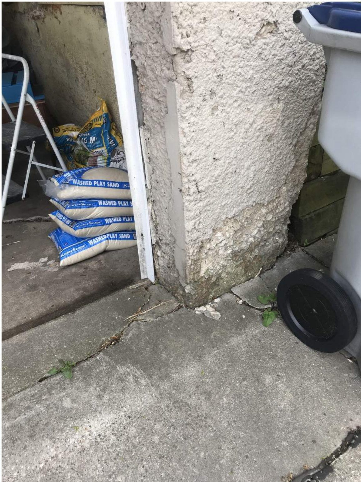
Photo 7 - Northwest Corner of the Existing Garage Showing Deterioration of the Stucco and Concrete