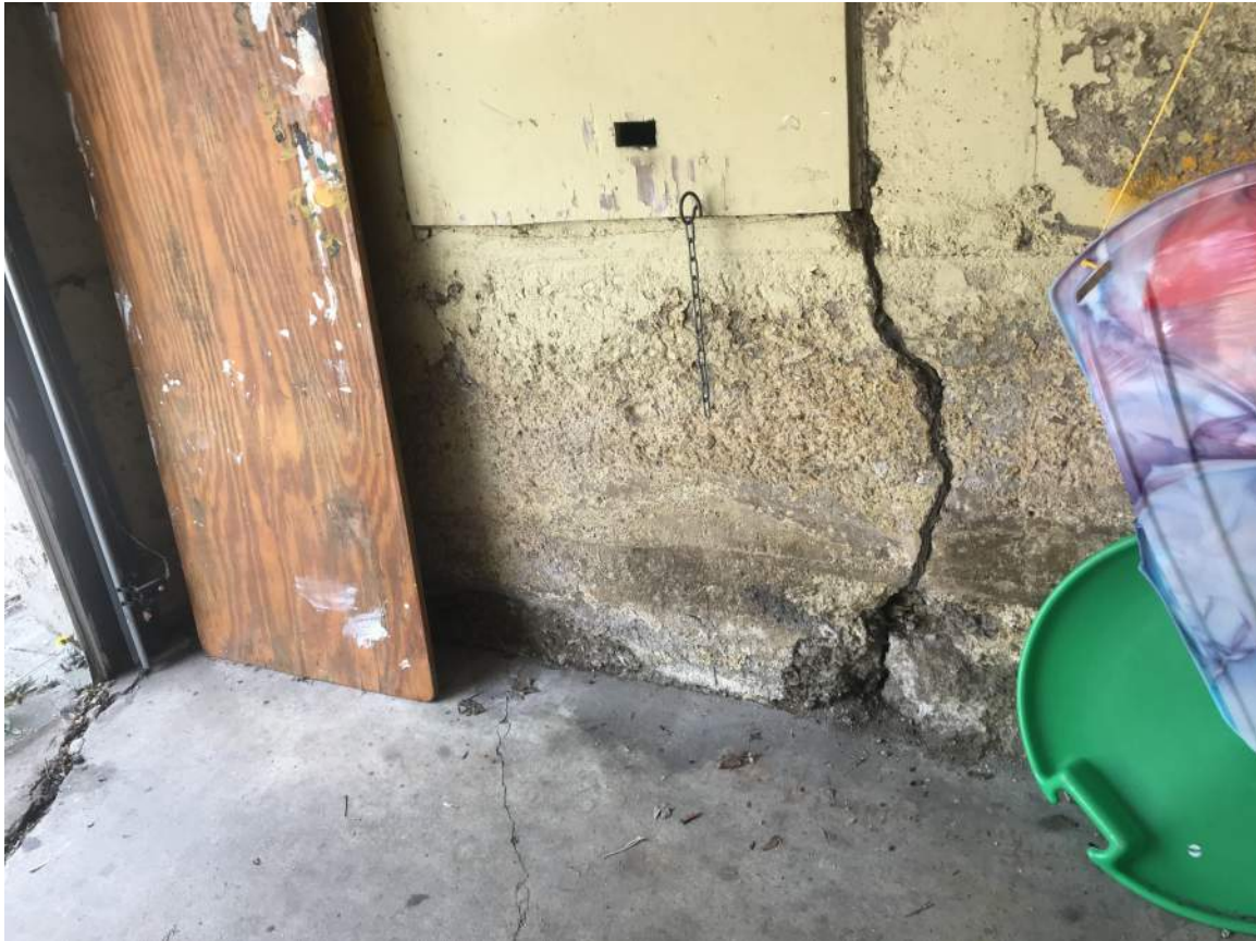
Photo 8 - East Elevation of the Interior of the Existing Garage Showing Deterioration of the Structure