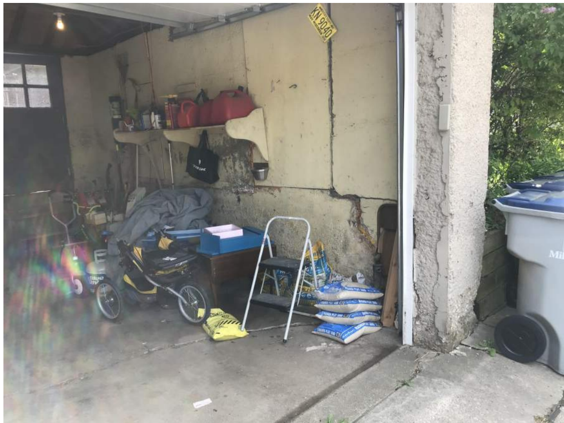
Photo 9 - West Elevation of the Interior of the Existing Garage Showing Deterioration of the Structure