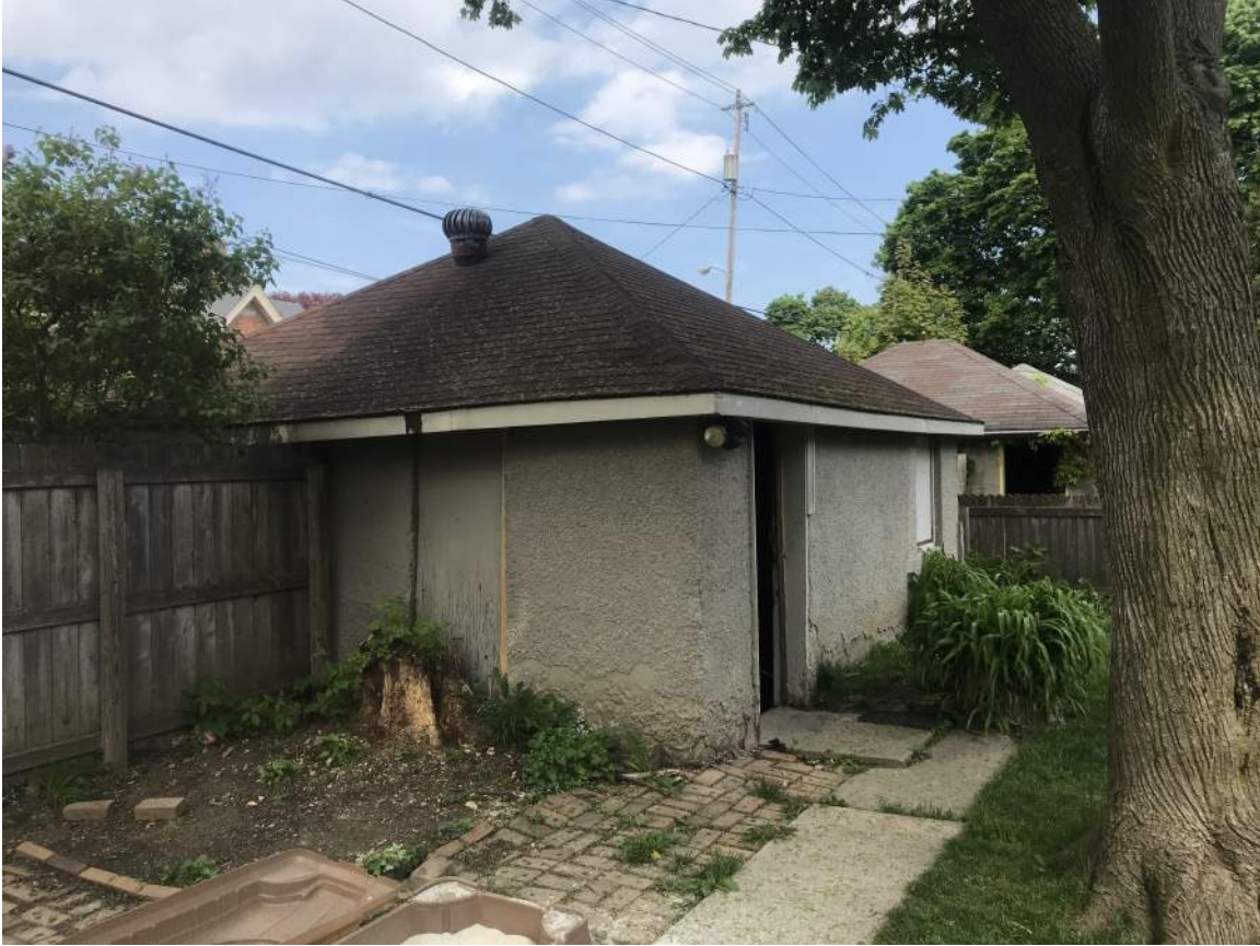
Photo 3 - West Elevation of the Existing Garage