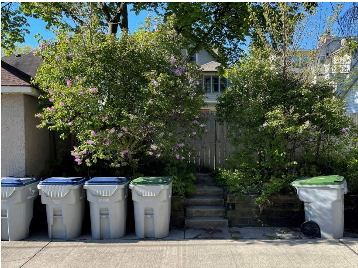
Photo 6 - North Elevation of the Lot Showing the Existing Retaining Wall and Fence West of the Garage