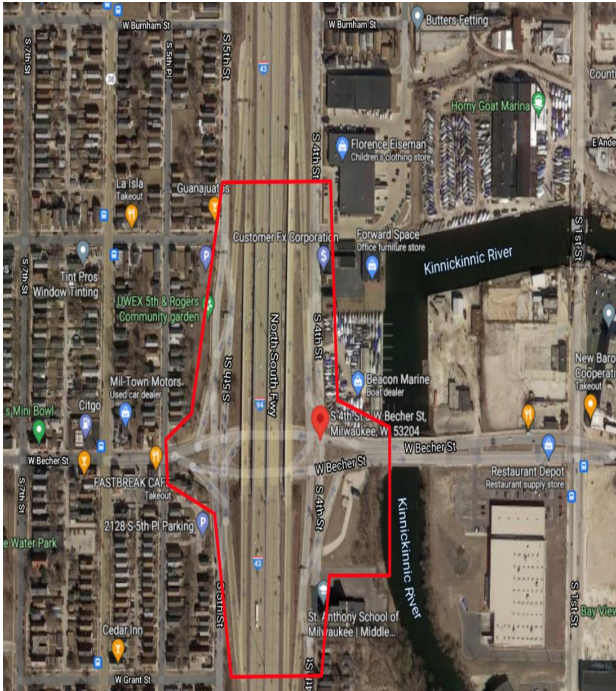
Exhibit A Map of Becher Street Overpass Green Infrastructure