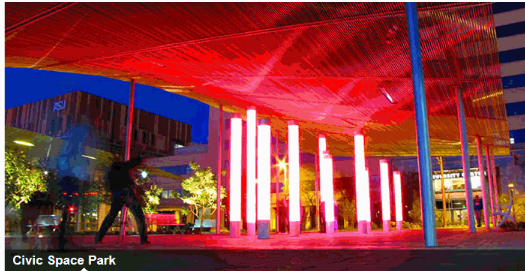
Civic Space Park