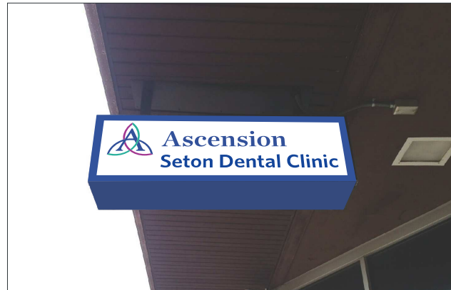
Recommended - Side A