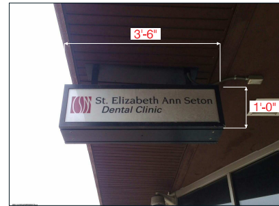
Detail Side A