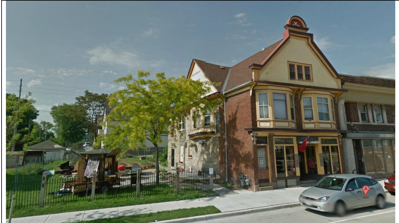
Amaranth Bakery with green space and gardens to the east.