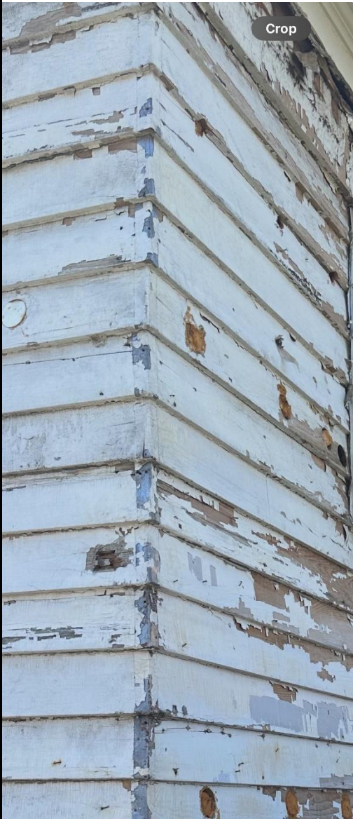
Existing clapboard and condition of existing corner