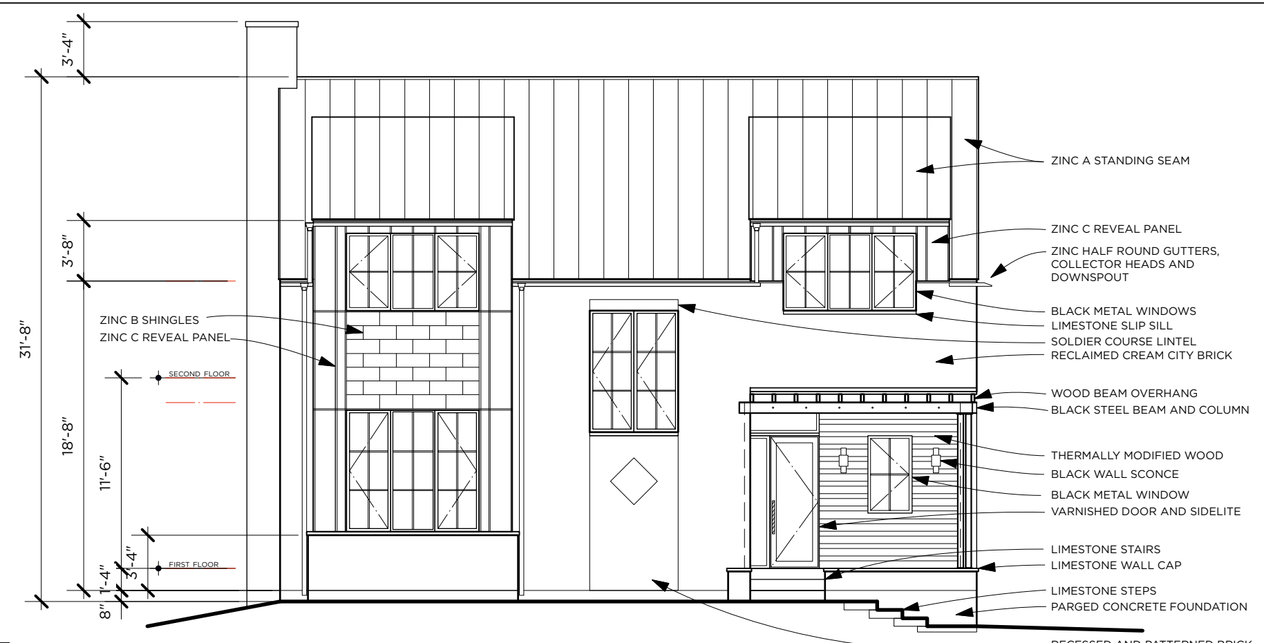
1 EAST ELEVATION SCALE: 1/8" = 1'-0"