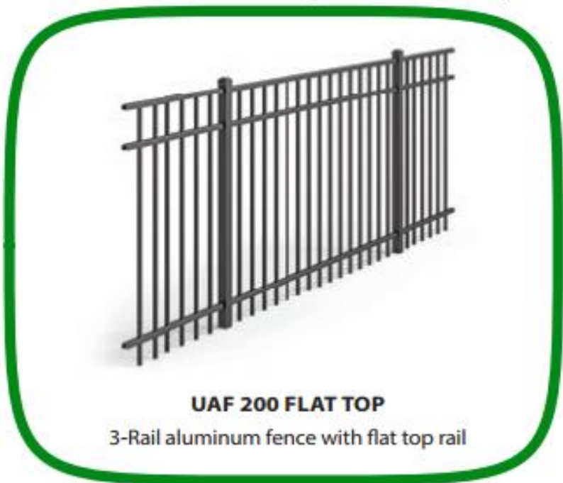
UAF 200 FLAT TOP