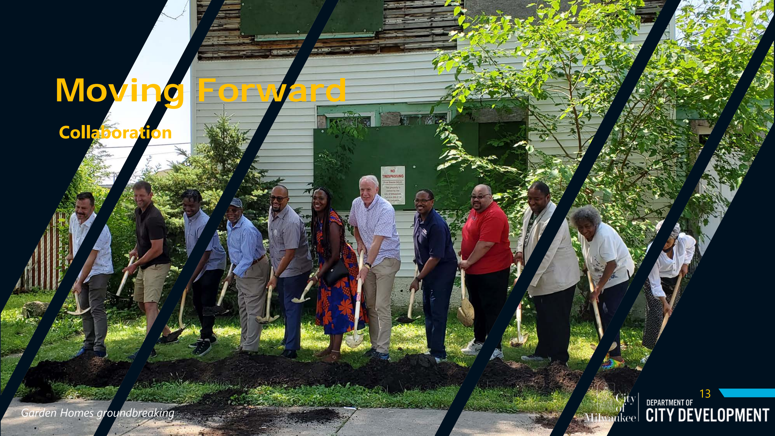
Garden Homes groundbreaking