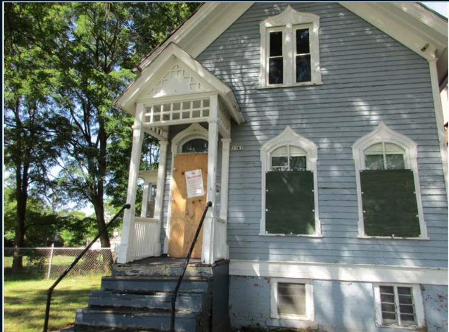
2361 N. Vel R. Phillips Ave. BEFORE