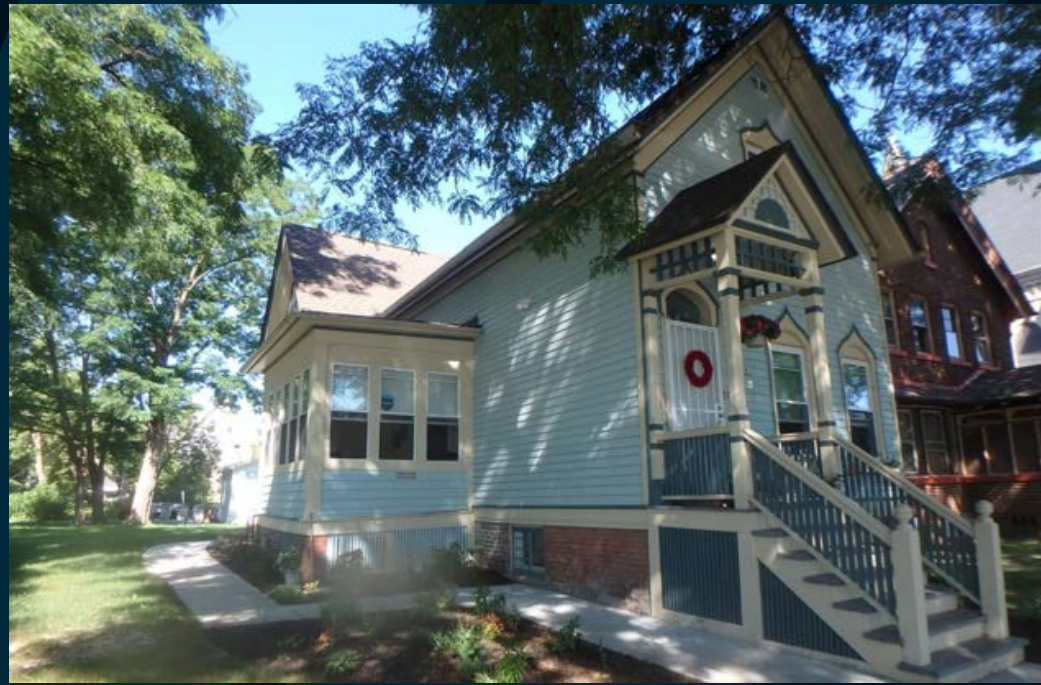
2361 N. Vel R. Phillips Ave. AFTER