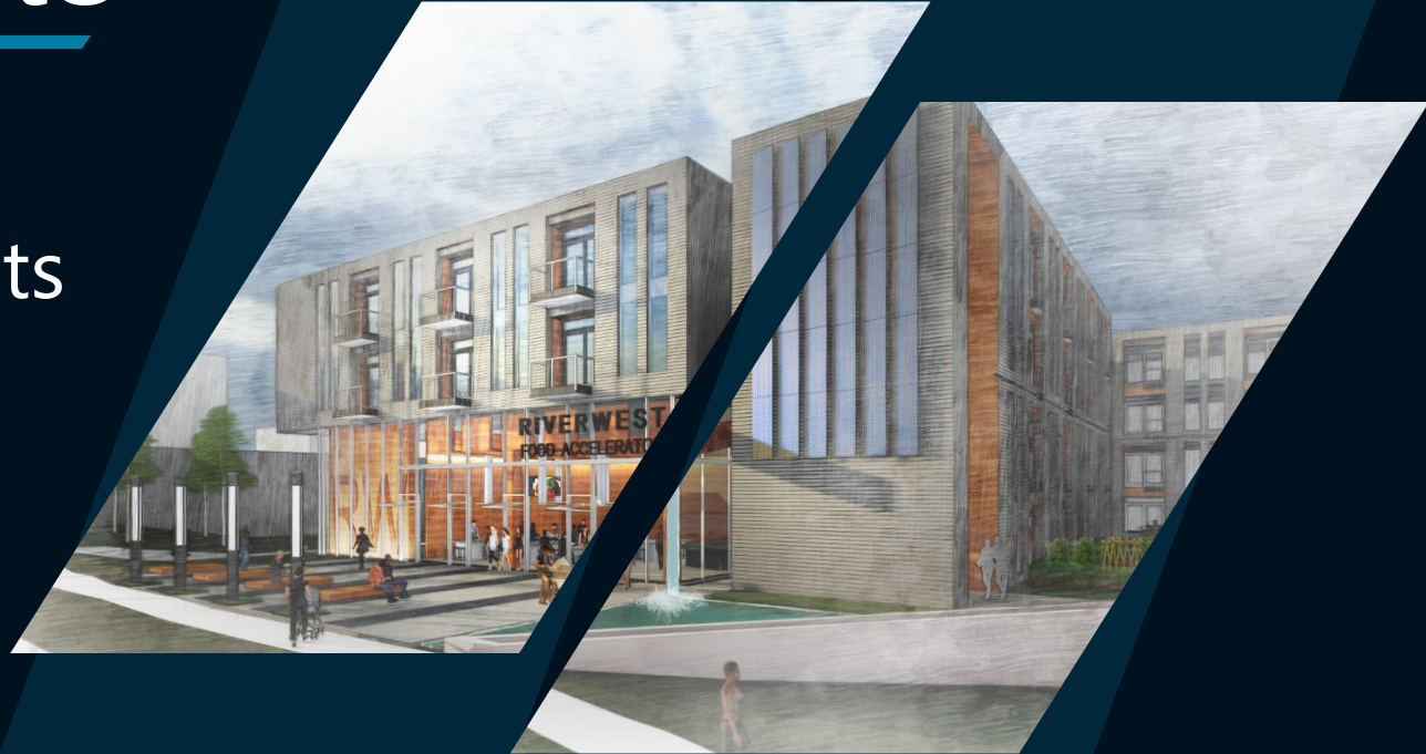
Riverwest Food Accelerator -91 affordable housing units (rendering by Engberg Anderson Architects)