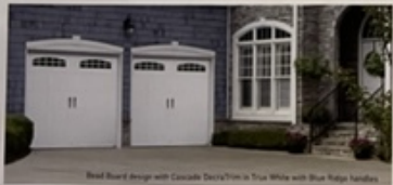
Bead Board design with Cascade Decors/Trims in True White with Blue Ridge handles.