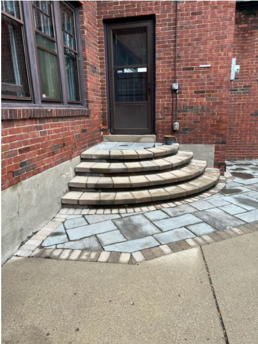
Existing backyard, steps, and brick condition.