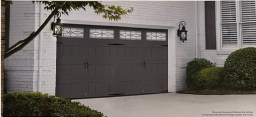
Recessed design with Mission Decors/Trims in Charcoal Strip with Blue Ridge handles and hinges.

Beauty that's more than skin deep. With the Amarr Hillcrest collection, you get more than a custom carriage house look with a wide range of colors, decorative hardware and window styles. You get exceptional style and durability with conventional hardware at a competitive price. The Amarr Hillcrest collection. Value is a beautiful thing.