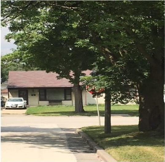
Blocked traffic signals & signs