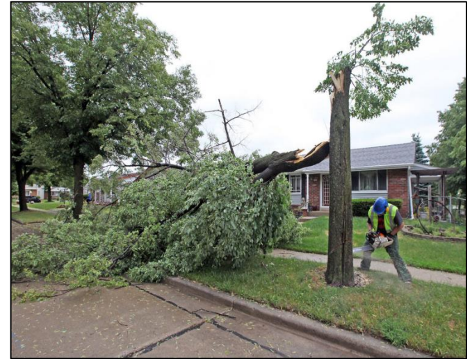
Storm damage incidents