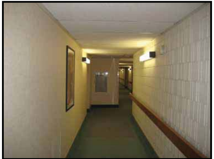
Interior Photos of Existing Subject Property