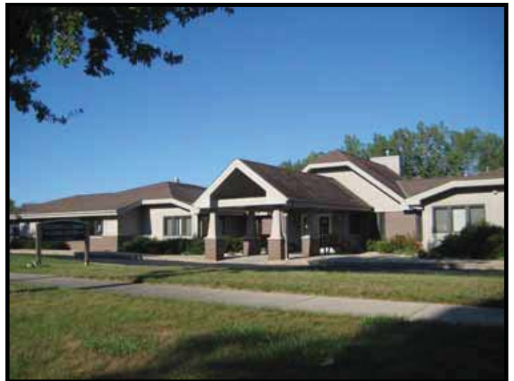
Wisconsin Lutheran Living Center Directly North of Site