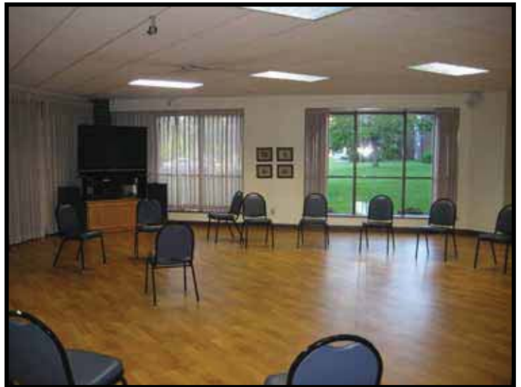
Interior Photos of Existing Subject Property