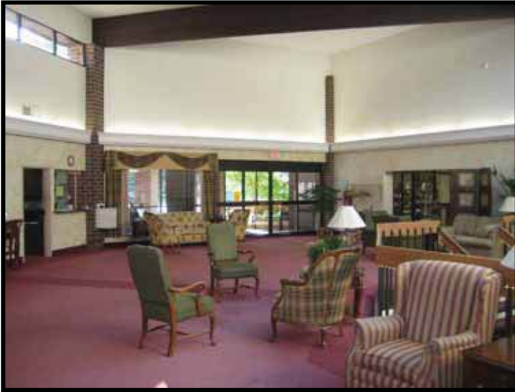
Interior Photos of Existing Subject Property