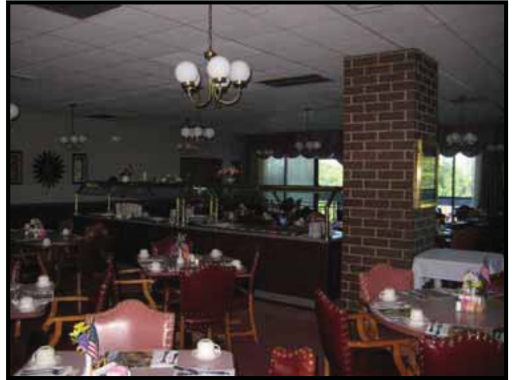
Interior Photos of Existing Subject Property