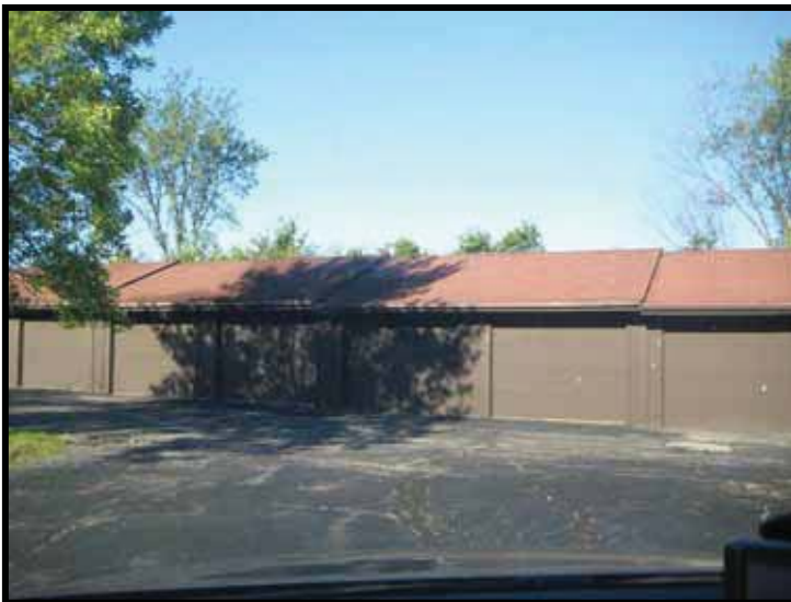
Exterior Photos of Existing Subject Property