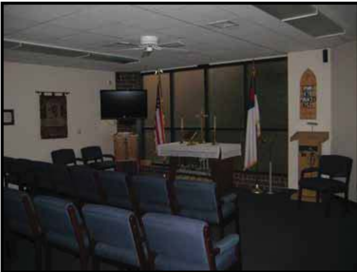
Interior Photos of Existing Subject Property