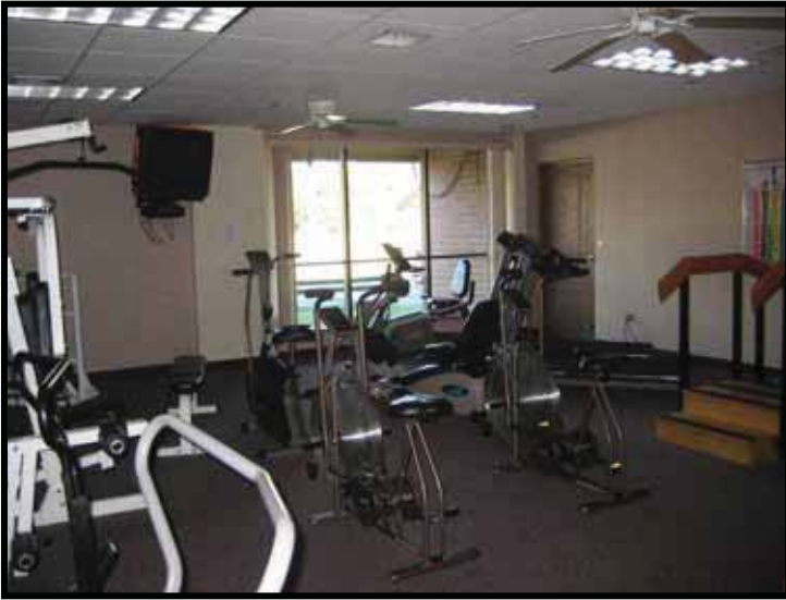
Interior Photos of Existing Subject Property