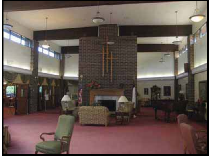
Interior Photos of Existing Subject Property