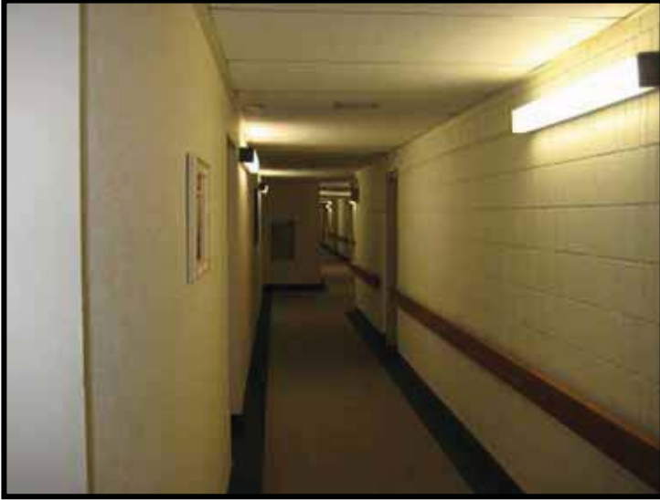
Interior Photos of Existing Subject Property