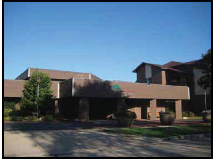
Exterior Photos of Existing Subject Property