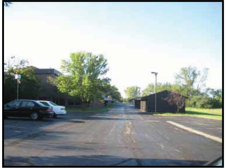
Exterior Photos of Existing Subject Property