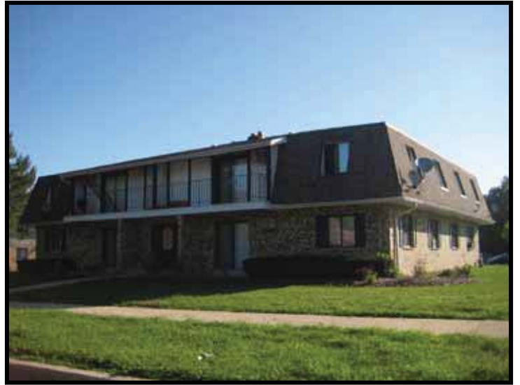
Representative Multifamily Near Site