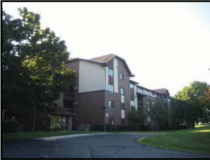
Exterior Photos of Existing Subject Property