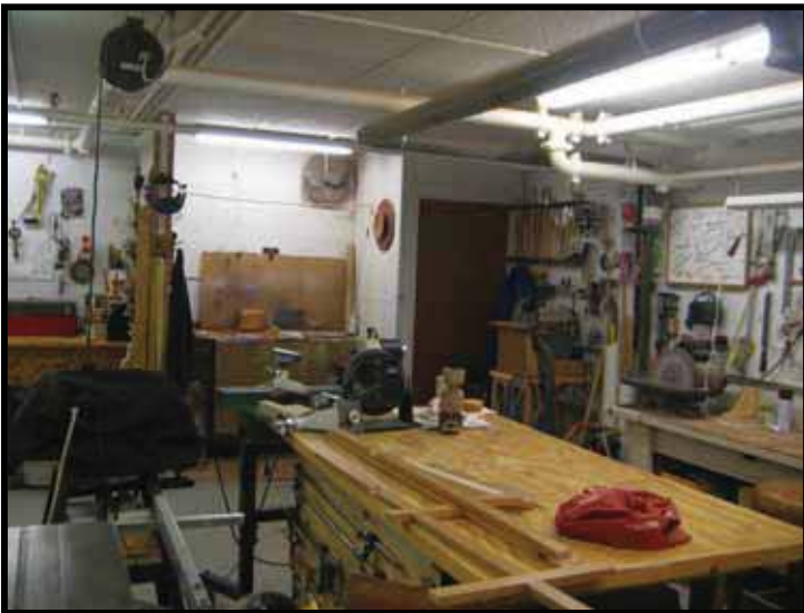
Interior Photos of Existing Subject Property