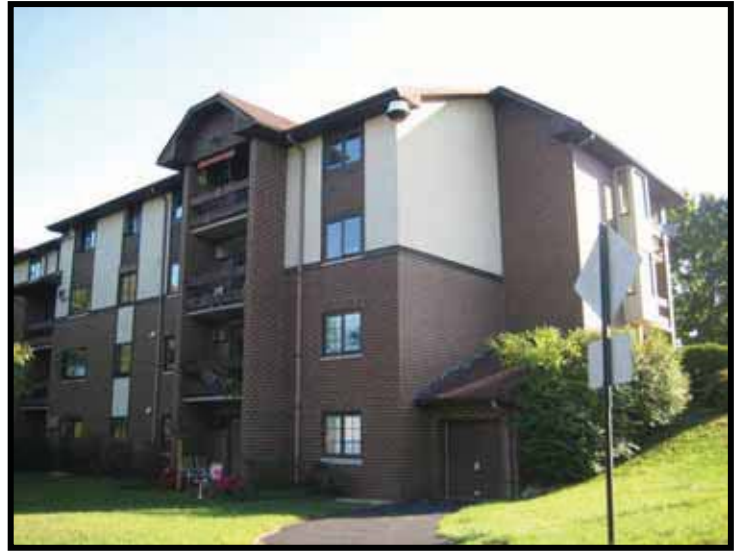
Exterior Photos of Existing Subject Property