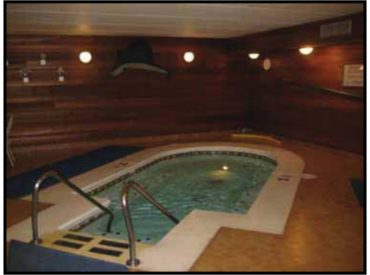
Interior Photos of Existing Subject Property