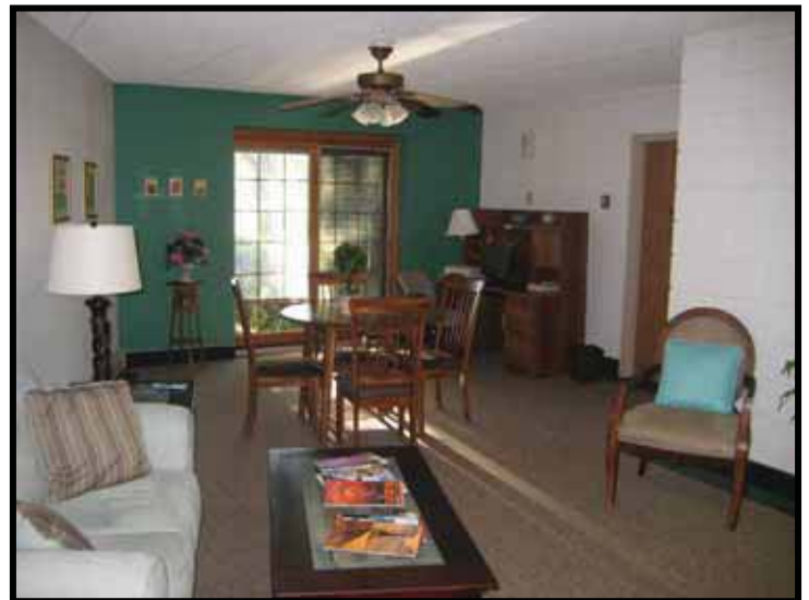
Interior Photos of Existing Subject Property