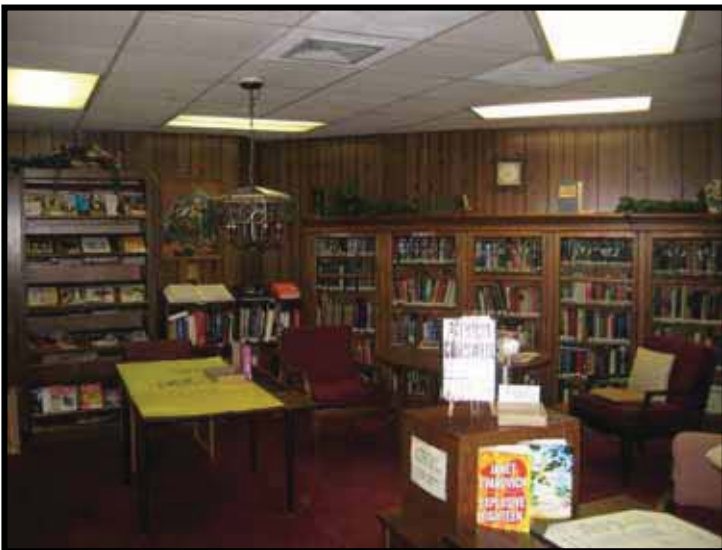
Interior Photos of Existing Subject Property