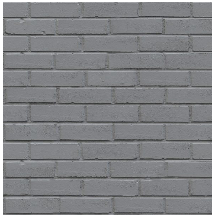
Painted Brick (color representative)