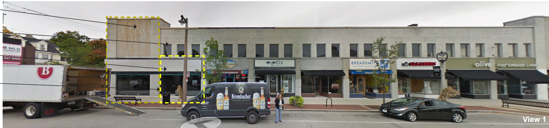
Existing Streetscape (Eastside of Downer Ave)

Replace existing storefront entry and windows