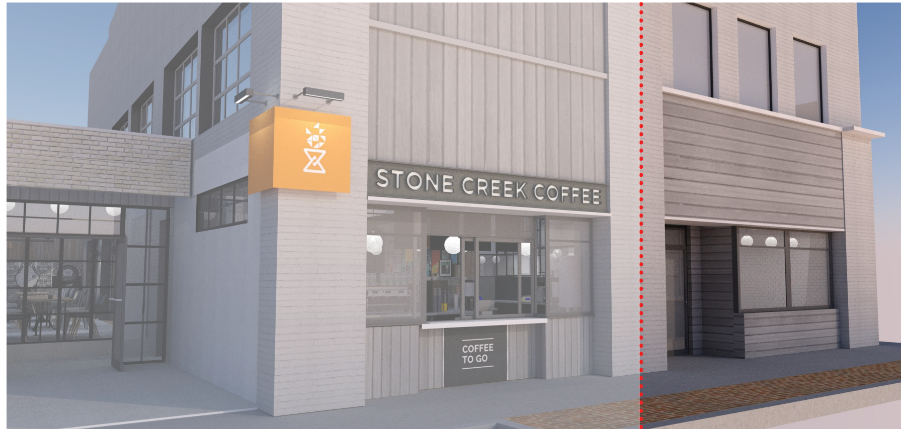
Rendering Looking Southeast

Previously Approved Project Addition to Project