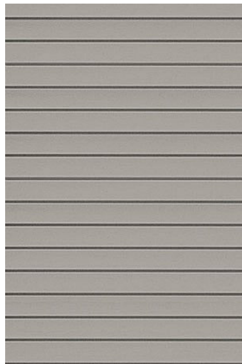
Wood Siding to Match Existing (image representative)