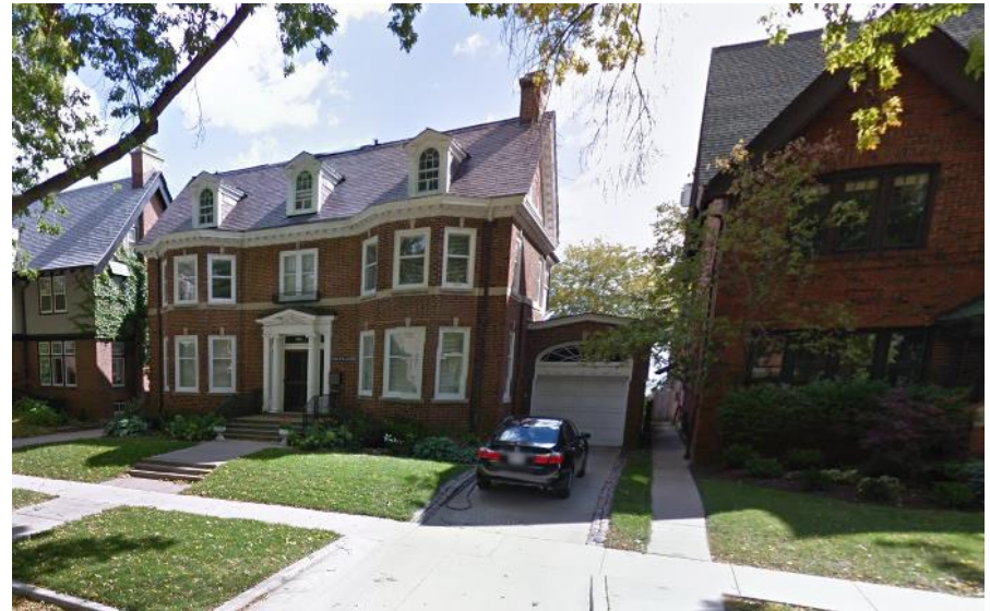
Existing conditions, October 2015, south at right of image