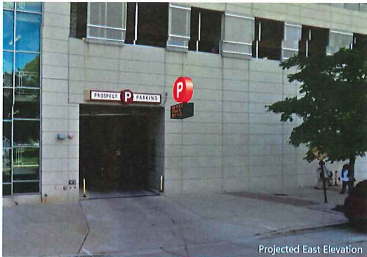
Projected East Elevation