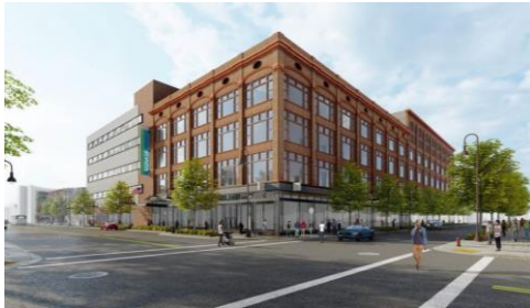
ThriveOn King (53212)