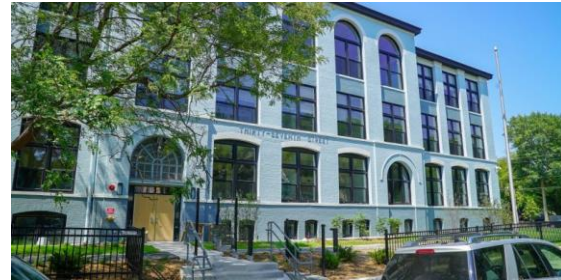
37 th Street School Apartments (53208)