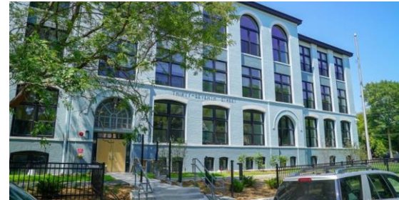
37 th Street School Apartments (53208)