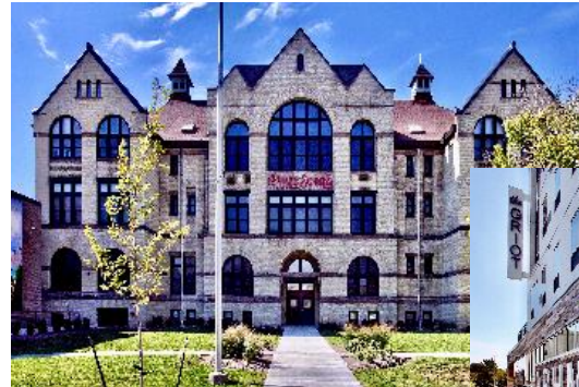
Garfield School Apartments / The Griot