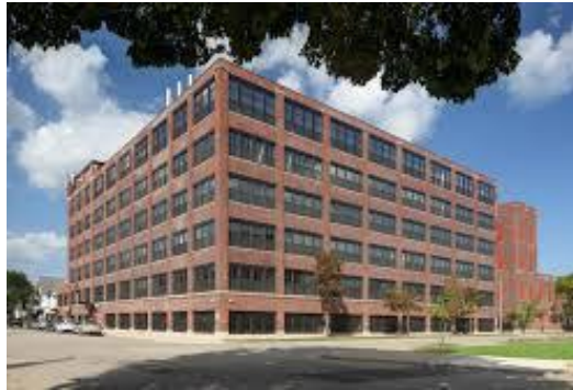
Welford Sanders Historic Lofts