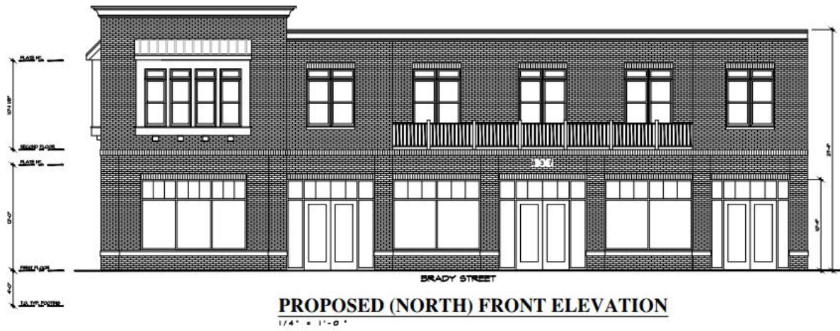
North and East Elevations