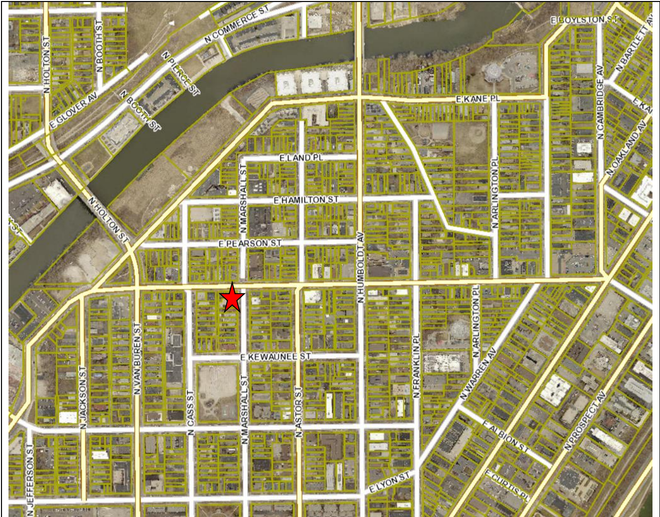
Development site location on Brady Street

1697 North Marshall Street: A City-owned vacant lot acquired through tax foreclosure on August 16, 2013. The lot totals 3,480 square feet and is located in the Lower East Side neighborhood on the Brady Street commercial strip, which is a local Historic District.