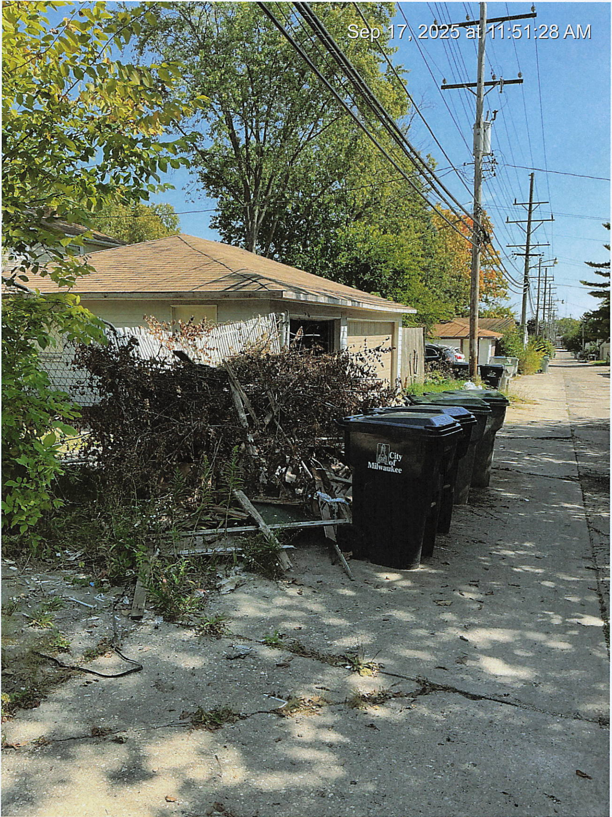
7937 W VILLARD AV, MILWAUKEE, WI 532183516