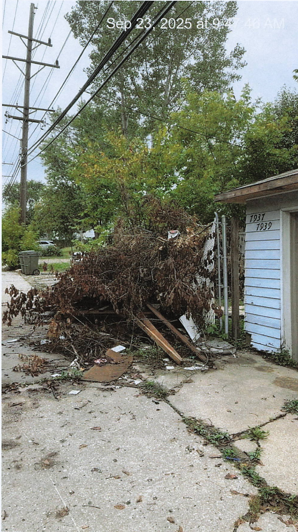
7937 W VILLARD AV, MILWAUKEE, WI 532183516