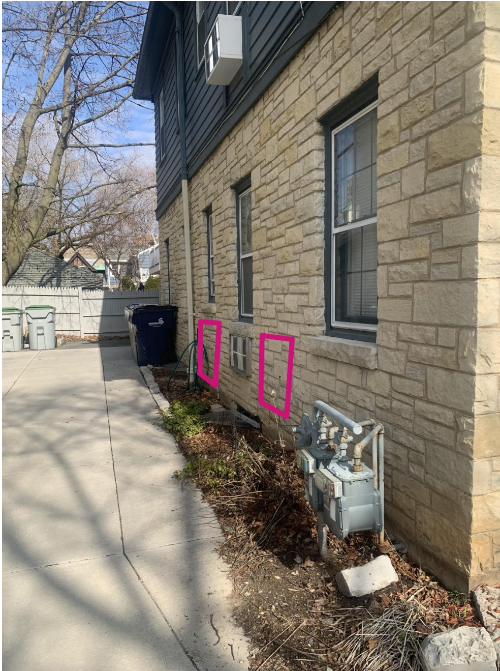
Position of condenser units.