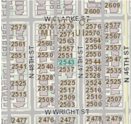
Parcel location within Milwaukee County