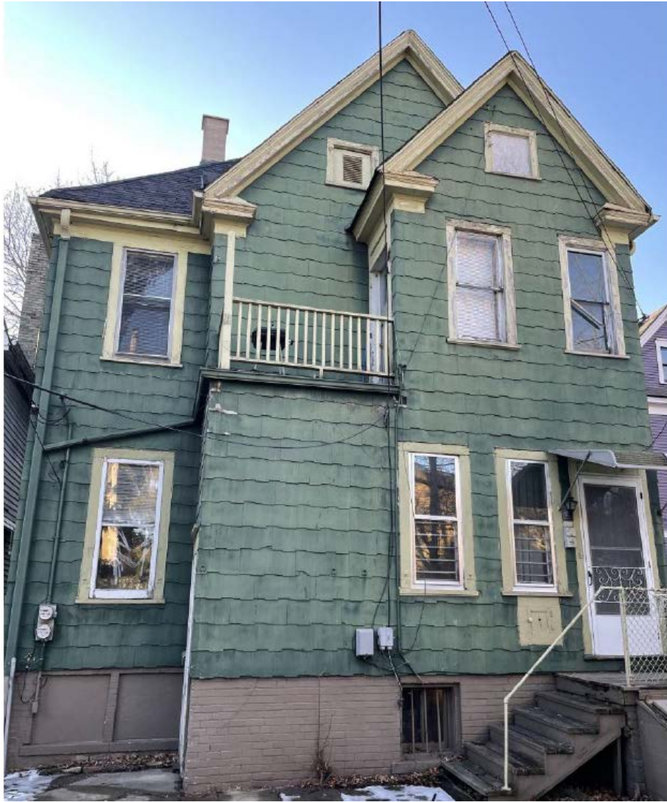
East elevation – existing condition