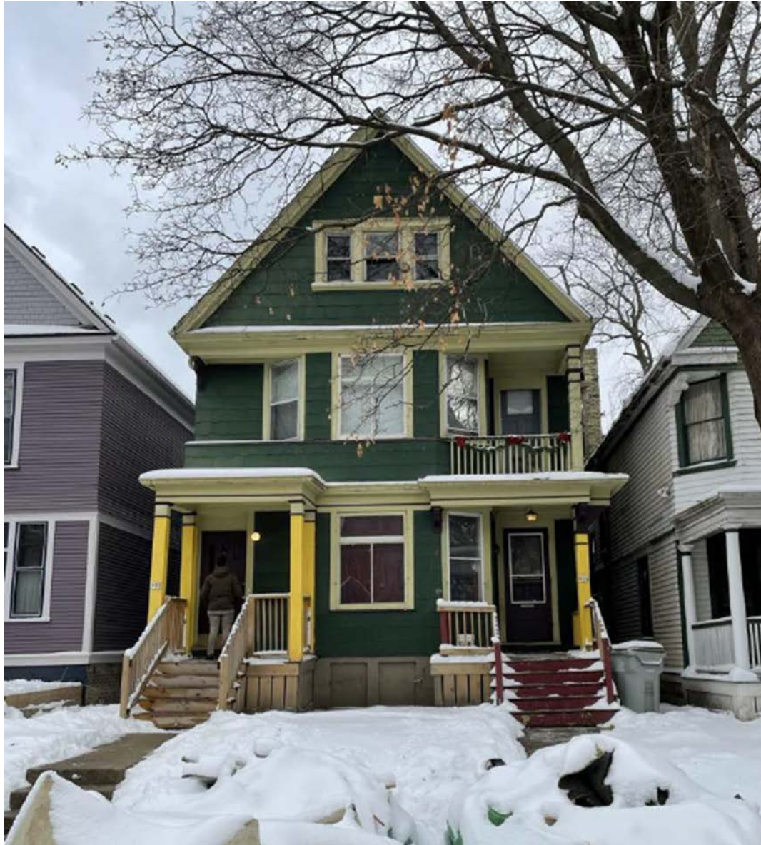
Primary (west) elevation – existing condition