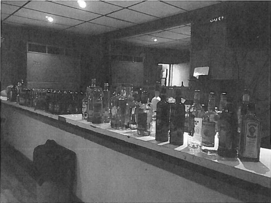
Leden's Villard Inn – 4923 W. Villard Avenue, Milwaukee. 02/04/2015: