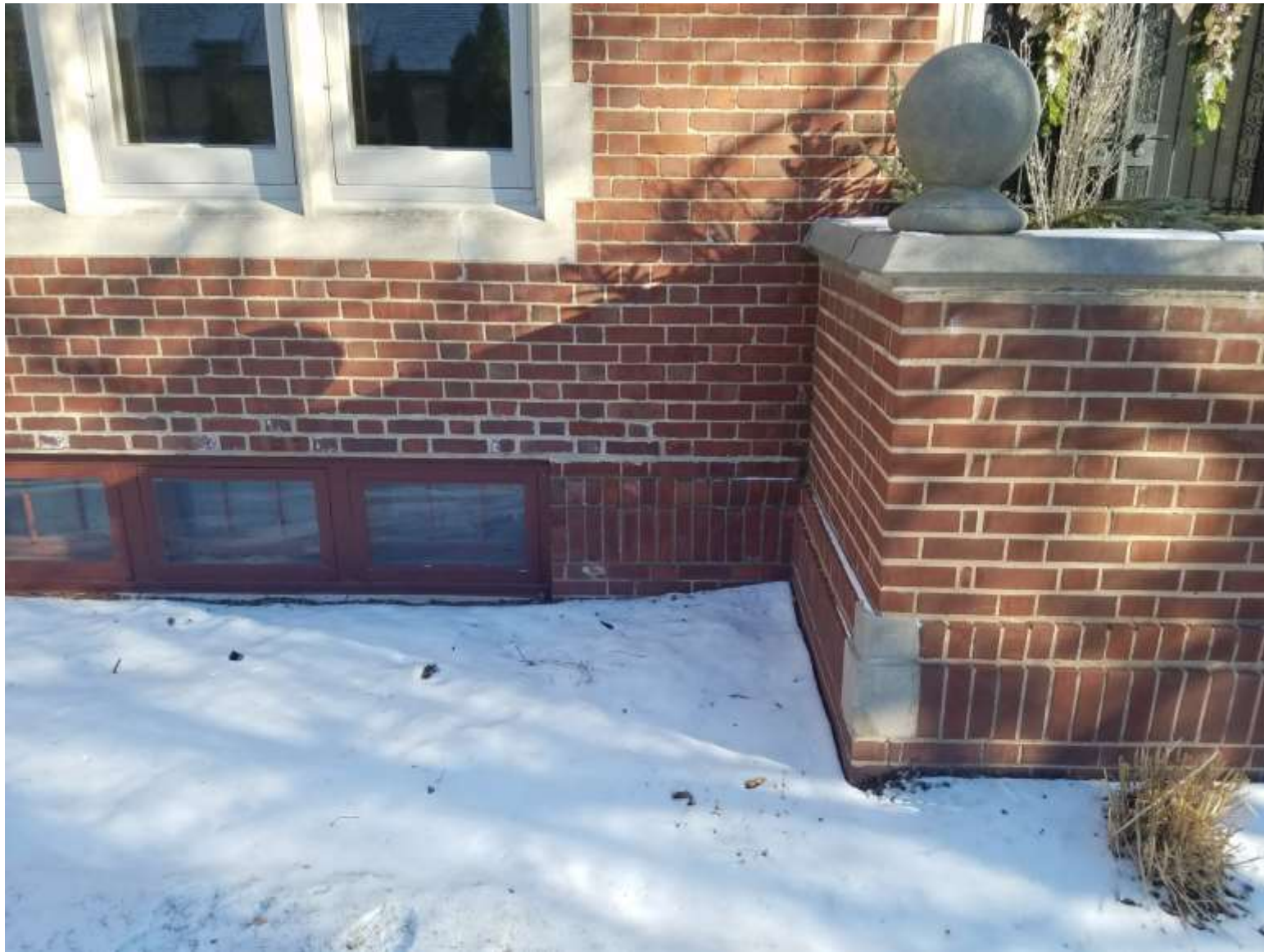
Install area is behind stair wall and in front of basement windows.