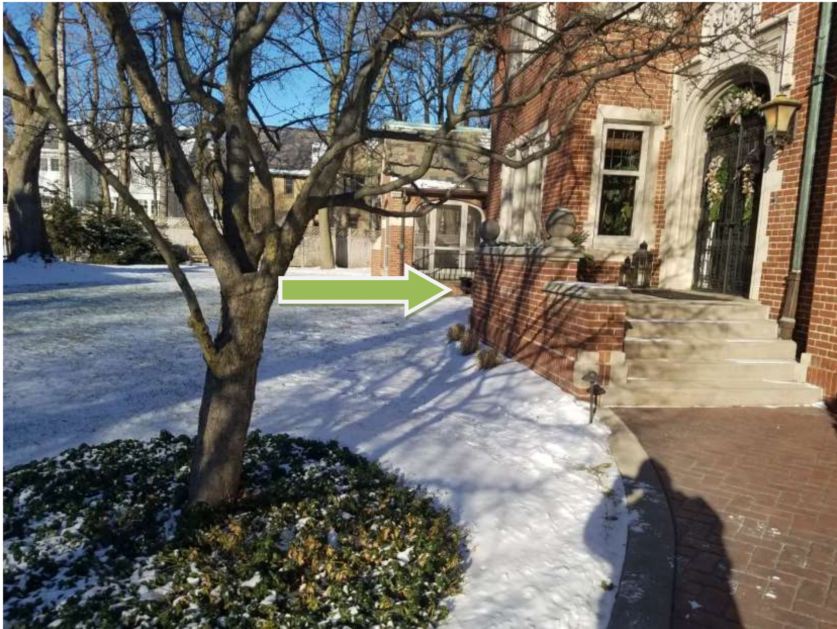
Install to rear (west) of stair wall