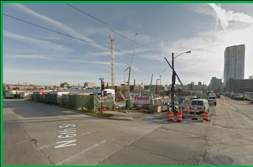
View from North 6 th Street and West Juneau Avenue