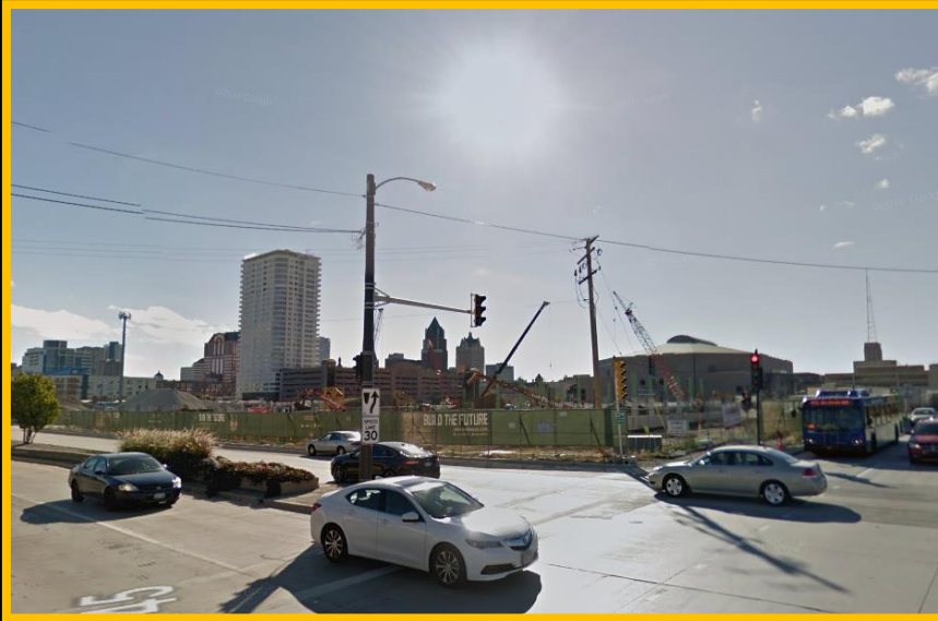
View from North 6 th street and West McKinley Avenue