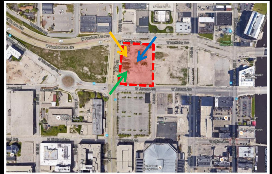
View from North 6 th Street and West Juneau Avenue