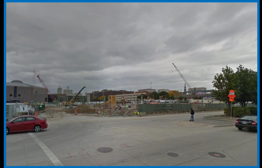
View from West McKinley Avenue, looking southwest