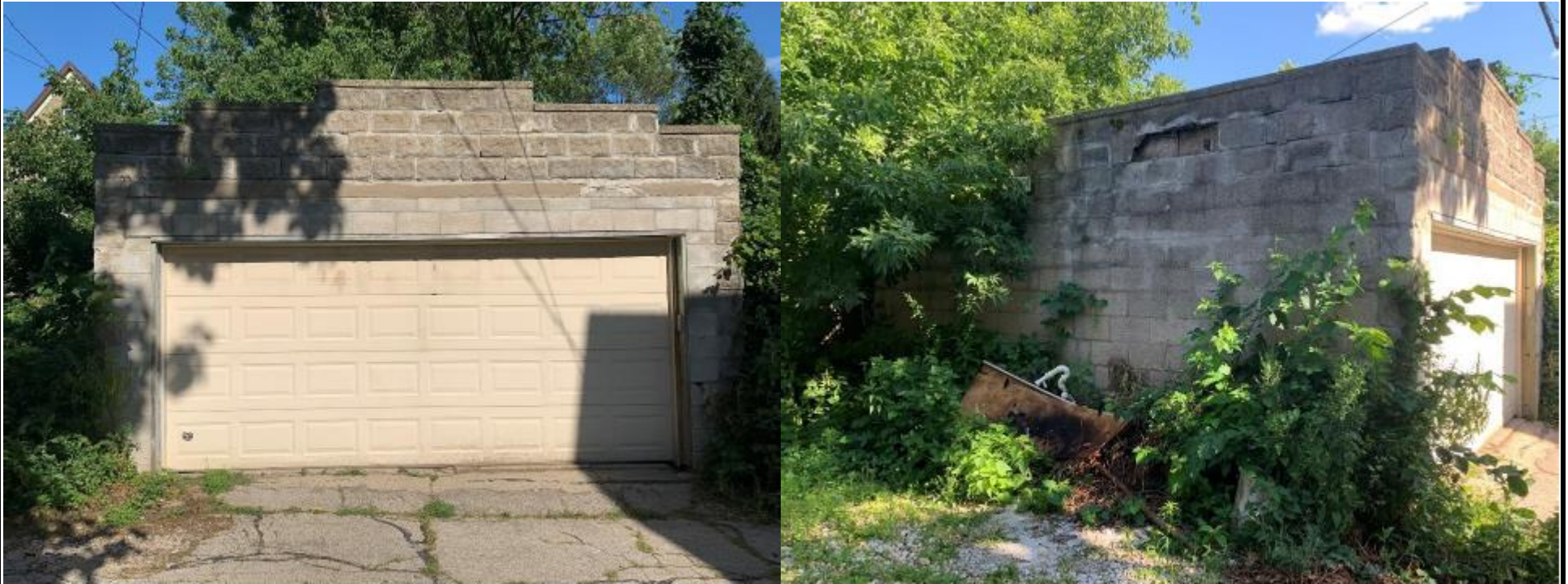
Existing garage west elevation.

Photographs of the existing garage to be demolished