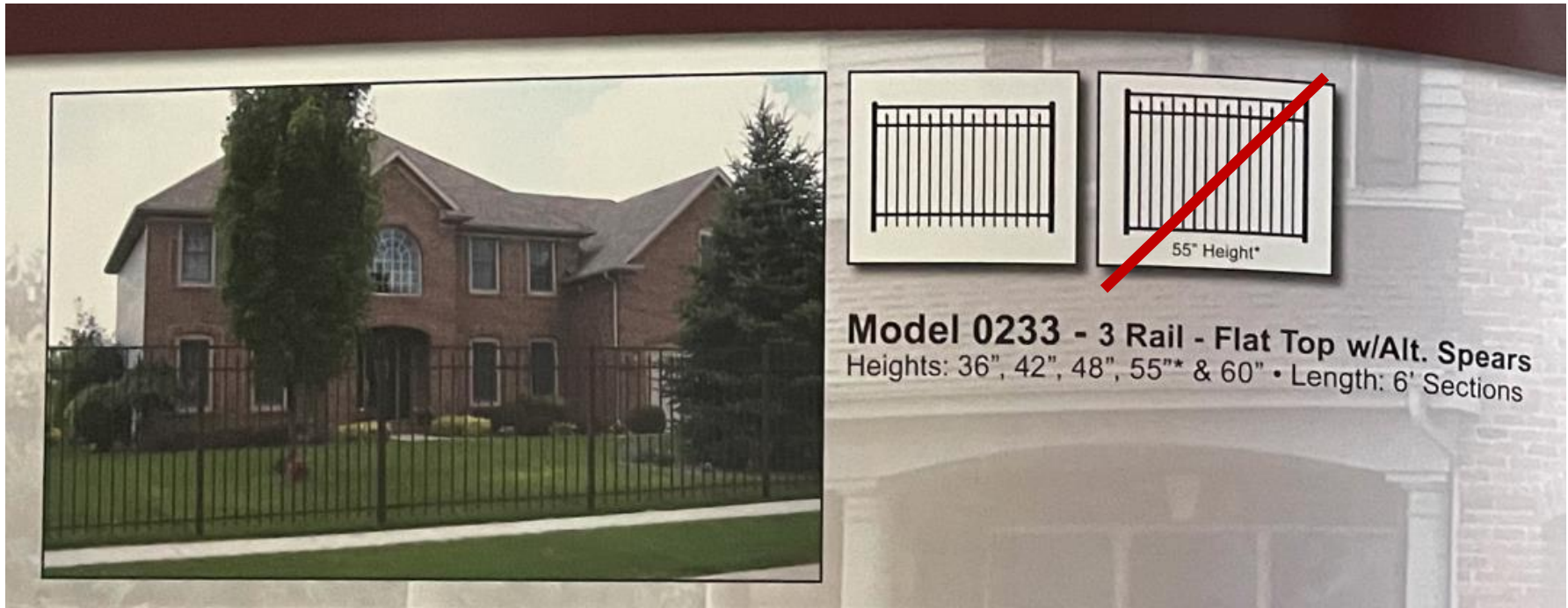
Design option 1.