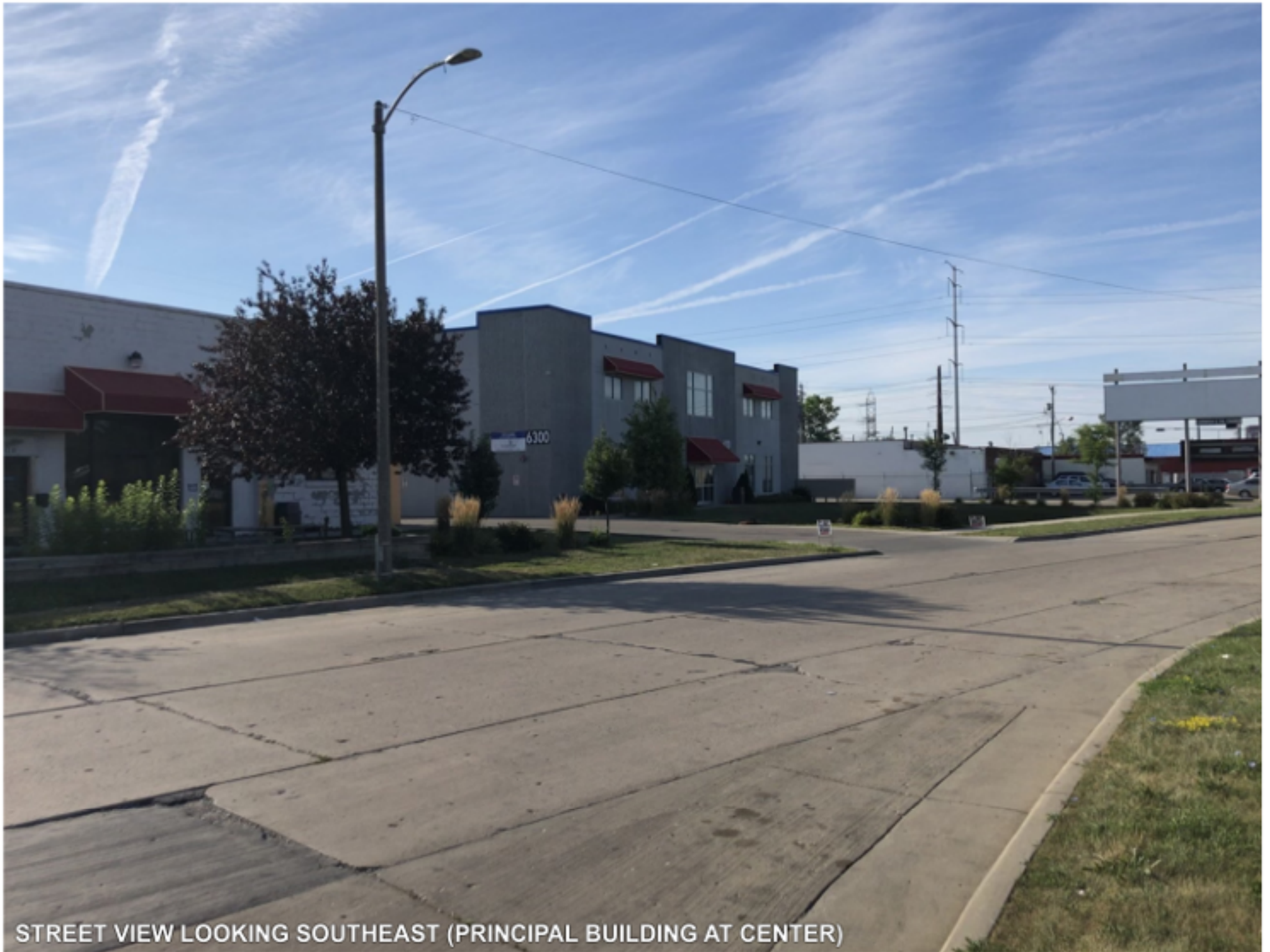
STREET VIEW LOOKING SOUTHEAST (PRINCIPAL BUILDING AT CENTER)