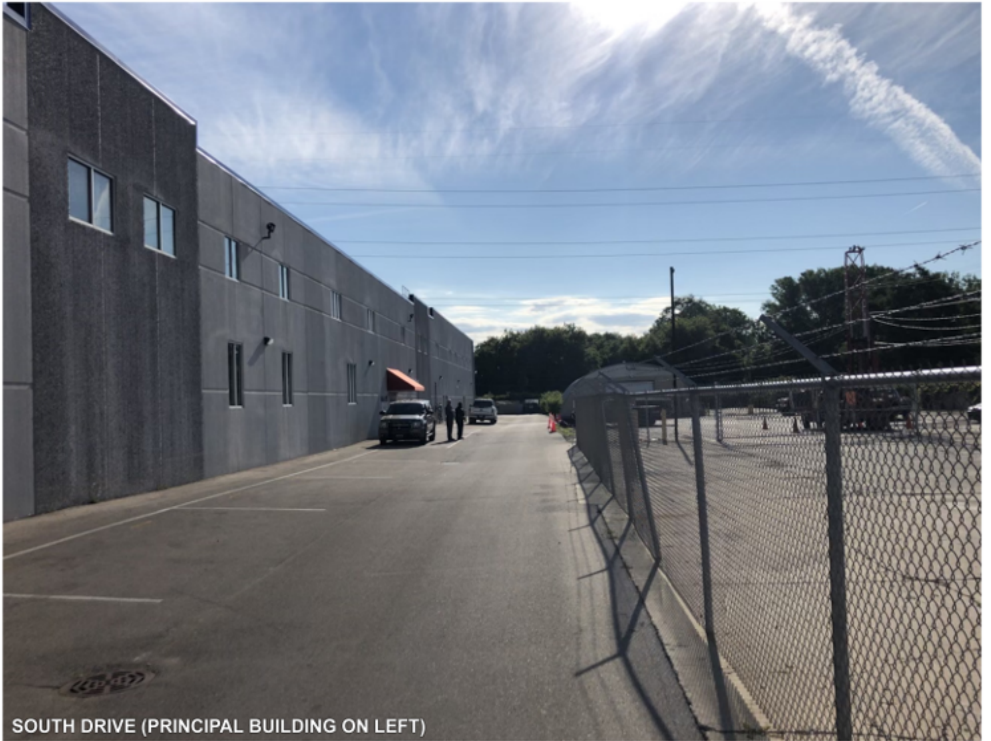
SOUTH DRIVE (PRINCIPAL BUILDING ON LEFT)