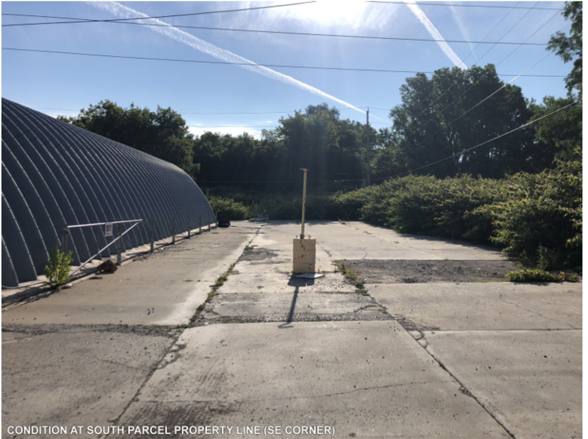
CONDITION AT SOUTH PARCEL PROPERTY LINE (SE CORNER)