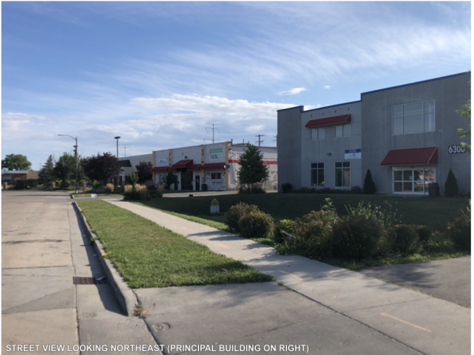
STREET VIEW LOOKING NORTHEAST (PRINCIPAL BUILDING ON RIGHT)