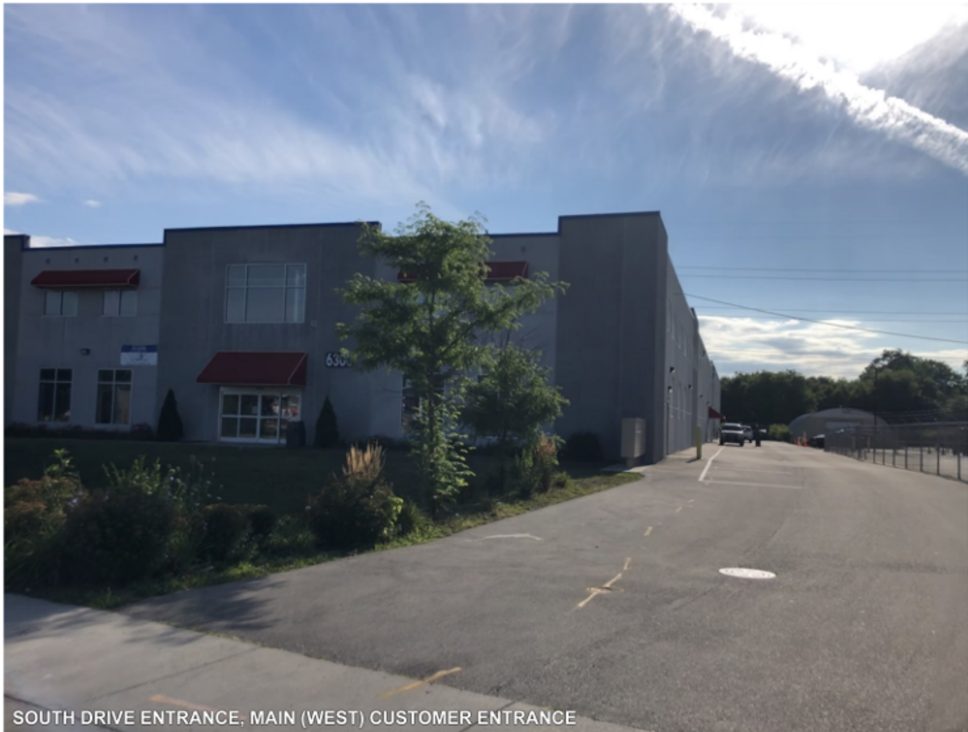
SOUTH DRIVE ENTRANCE, MAIN (WEST) CUSTOMER ENTRANCE