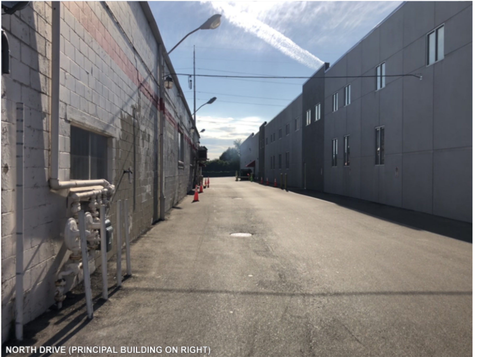
NORTH DRIVE (PRINCIPAL BUILDING ON RIGHT)