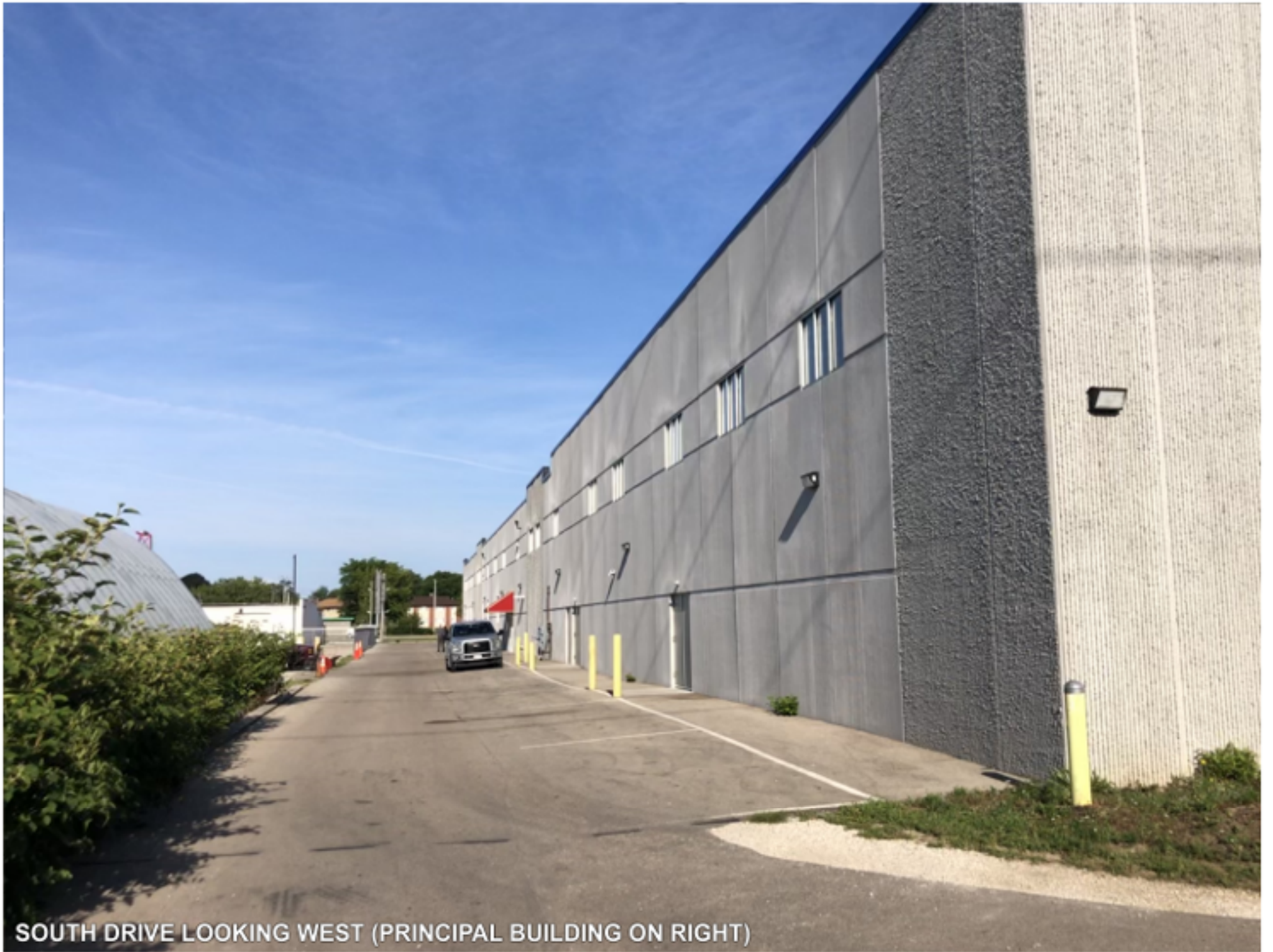
SOUTH DRIVE LOOKING WEST (PRINCIPAL BUILDING ON RIGHT)