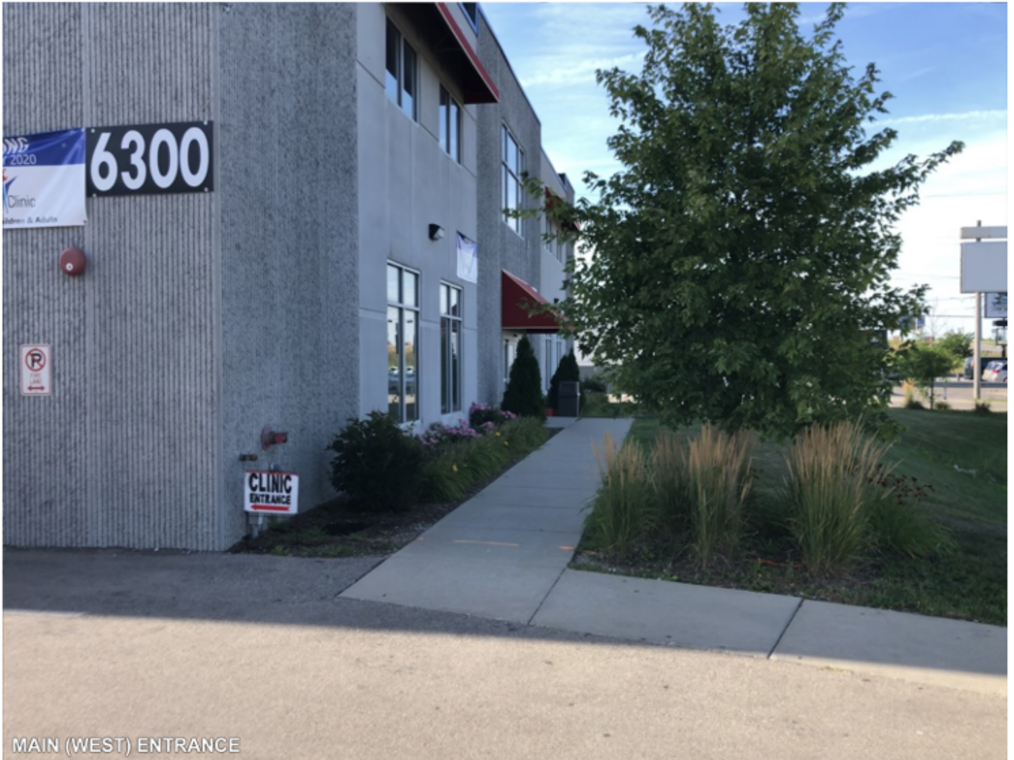
MAIN (WEST) ENTRANCE