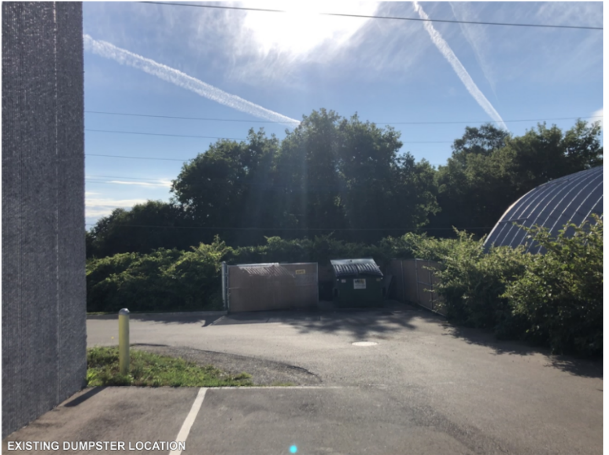
EXISTING DUMPSTER LOCATION