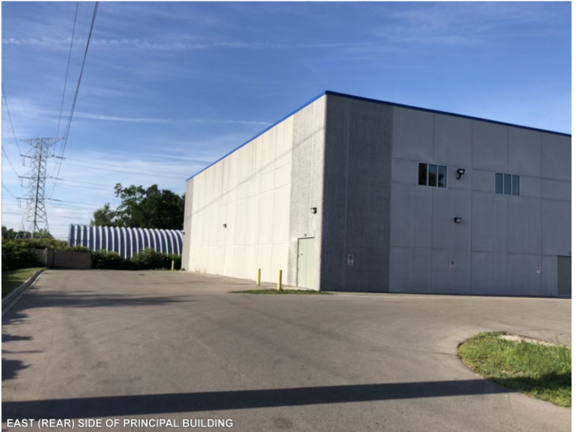
EAST (REAR) SIDE OF PRINCIPAL BUILDING