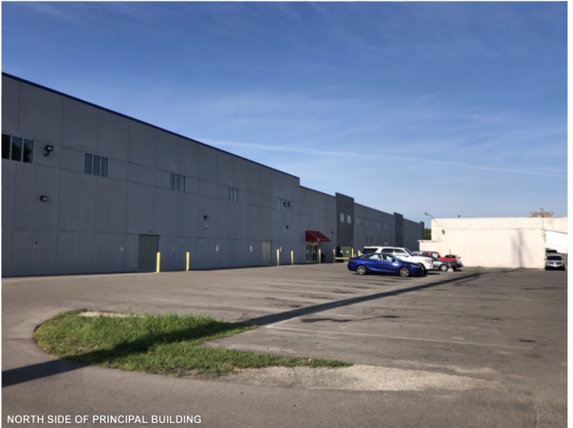
NORTH SIDE OF PRINCIPAL BUILDING