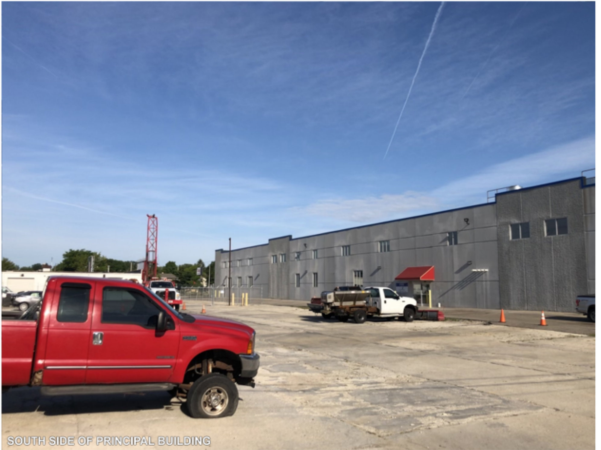
SOUTH SIDE OF PRINCIPAL BUILDING