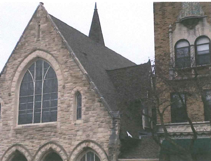
View from sidewalk west side of Astor St