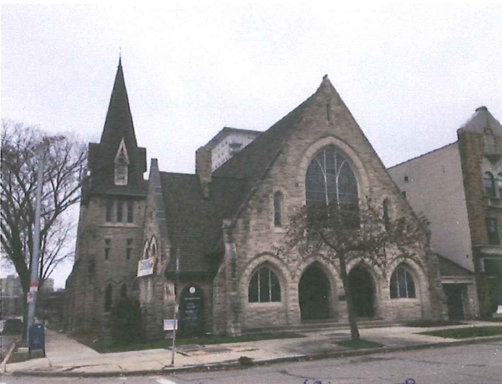
Astor St. - north angle