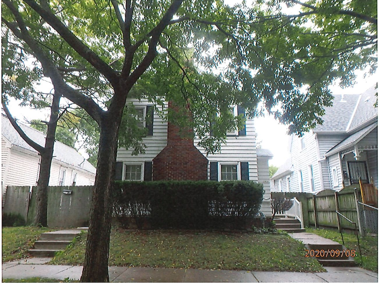
2432 North 25 th Street