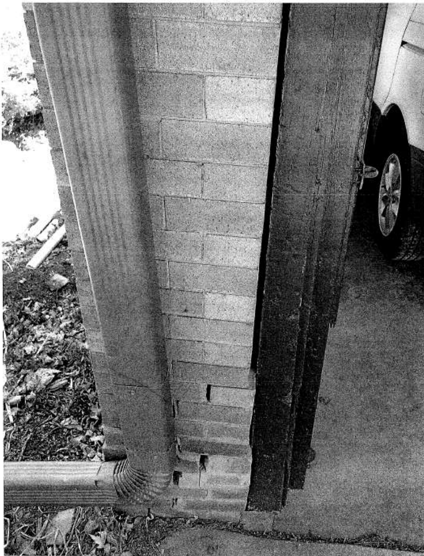
NW corner - WEST WALL